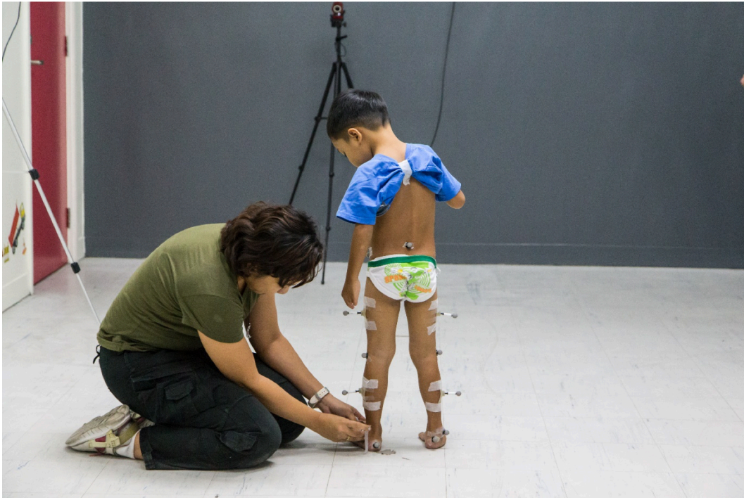
Figure 2. Paediatric patient being prepared for motion analysis, Manila, Philippines