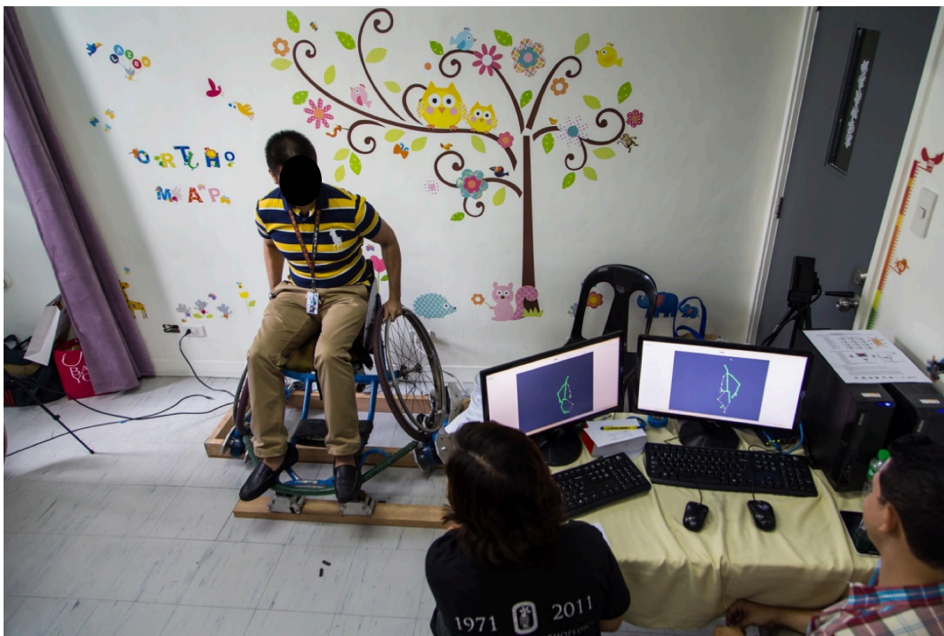
Figure 3. Wheelchair propulsion assessment system, Manila, Philippines