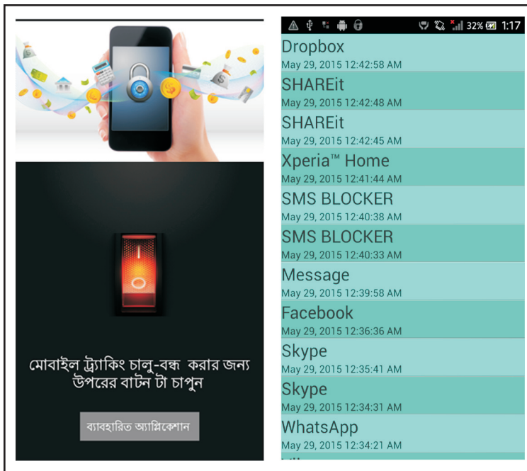
Figure 2. Screenshots of the Protiraksha application. Left: The application prompts the user to turn on tracking. Right: The application shows the log of timestamps of when different applications were accessed.

addition, it would be possible for the repairer to turn off the app or find other ways to access private data that bypassed this kind of surveillance. However, we designed the app to understand, if such monitoring software existed, how users and repairers would react to such a tool and if technical interventions like this might aid privacy during repair. After deploying the app, we conducted several interviews, described in the following section.