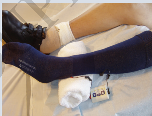
ES STOCKING DELIVERY

2) 89-year-old female with 25-year history of diabetes. AKA L-leg, previous amputation of 2nd, 3rd, and 5th toes R-foot. Goal: Keep R-foot/leg for functional bed/wheelchair/shower-chair/commode transfers. ABI: .46. Wound closed 8 weeks with ES stocking delivery method.