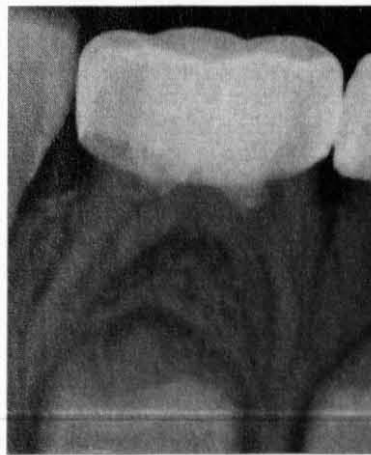
Figure 1b. Eleven months post-op, a periapical radiograph showed continued stability and furcation bone healing.