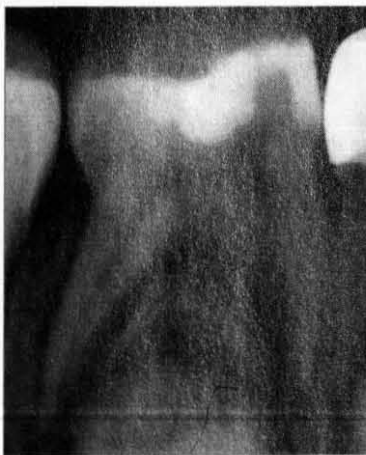
Figure 1a. Initial periapical radiograph showing a furcation radiolucency.

A clinical examination revealed a large, purulent, vestibular abscess adjacent to the primary mandibular right first molar. The tooth exhibited pathologic mobility and was depressible to occlusal forces. The patient was highly sensitive to percussion, and on palpation there was pain and exudate. A periapical radiograph revealed distal-occlusal caries extending into the