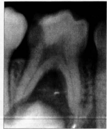
Figure 2a. Initial periapical radiograph showed dental caries extending to the distal pulp horn and a furcation radiolucency.