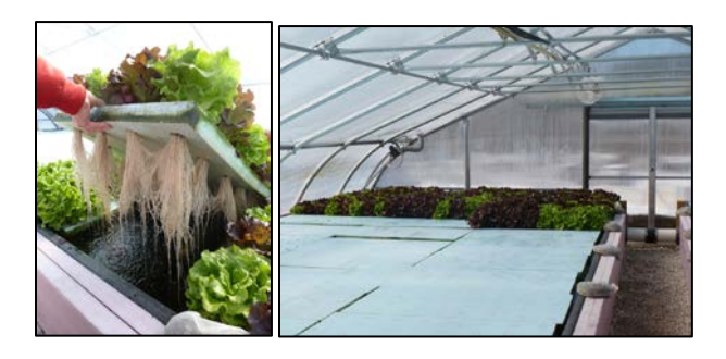
Figure 1. In a floating raft system, the body of the plants sits on top of Styrofoam boards that float on water, and the roots hang down into the water (left photo). A large commercial aquaponics unit in a green house is shown in the photo on the right.

The small aquaponics system was designed so that it could be assembled and disassembled easily with only bolts and nuts (no nails or screws). The boards are conventional pine 2x4, 2x6, and 2x8 lumber with a width of 1.5 in. (38 mm) Treated lumber was not considered because of the possibility that the chemical treatment would contact the water. The plants and sump pump tanks are formed by the pine boards. Five cm (2 in.) thick foam boards are placed against the pine boards, and then a food-grade EPDM (ethylene propylene diene monomer) liner is laid on top of the foam boards. The fish tank is a food-grade polyethylene tank. A high efficiency light is mounted above the plants tank to supplement natural light. The plumbing pipe and tubing is food-grade plastic.