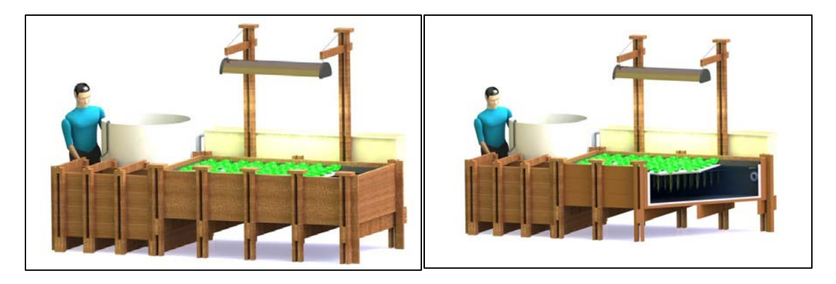
Figure 3. A 3-D drawing of the small aquaponics system (left). A cut-away view of the water tank for plants (right).