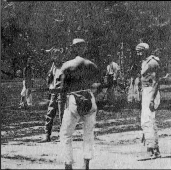
Figure B: Barefoot stickball players (Choctaw) wearing cloth full-length breechclouts with extremely short panels plus leggings with pants underneath. Tucker, Mississippi, 1900?-1915? Although the Mississippi Choctaw had retained their breechclouts for playing stickball, Anthropologist James Mooney noted that in North Carolina, the Cherokee had replaced their breechclouts with custom-made cloth shorts by the 1880s.

Note that the width of full breechclouts typically measured the distance between the wearer's hips, whereas modified ones, which were often wider, measured up to approximately one half the wearer's waist.