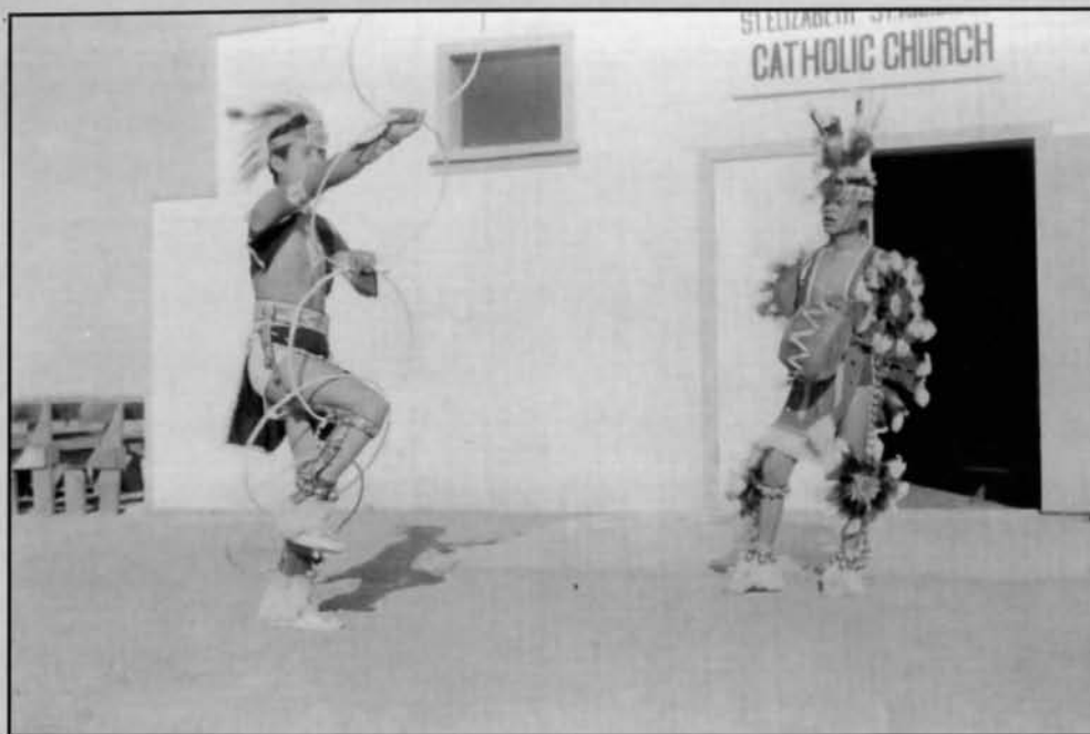
Figure E: Young fancy dancers (Mohave) wearing modified breechclouts or aprons (front and back breechclout panels). Colorado River Reservation, Poston, Arizona, 1956.

believes that this type with trunks evolved after 1900 in the Midwest or Oklahoma and gained prominence by the 1930s.