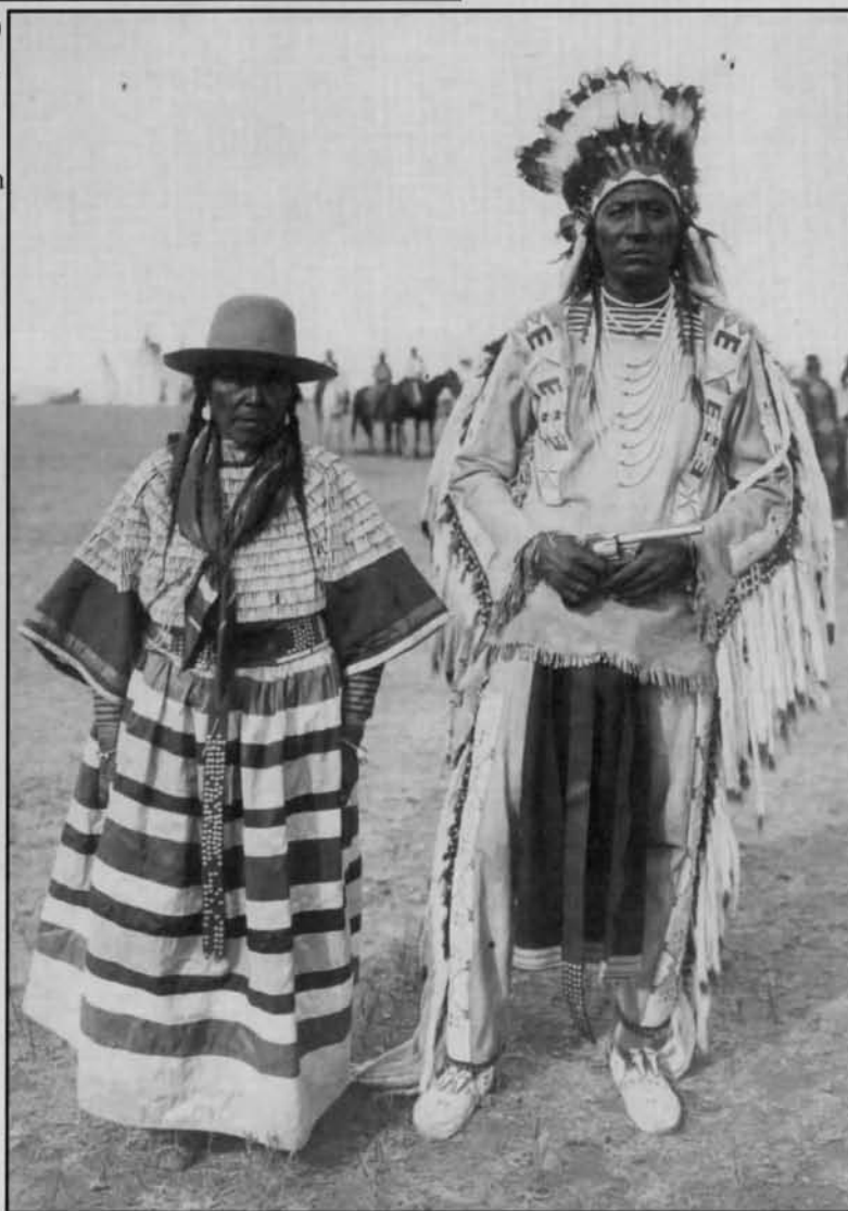
Figure F (below): An elder couple (Blackfoot) with the husband wearing a cloth full-length breechclout. Blackfeet Reservation, Montana, 1910. Fred H. Kiser, photographer.