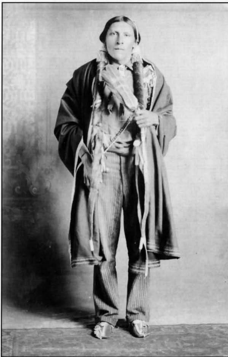
Figure A: By the early 20 th century, trousers had replaced breechclouts for some dances and ceremonies, such as shown by this peyote devotee (Kiowa) wearing a shirt and pants with regalia. Oklahoma, n.d.

Two types of modified breechclouts had evolved. First, a variation of the full breechclout comprised of three attached parts—a front and back panel and a center piece, which sometimes was made of lighter weight cloth and cut narrower where it passed between the legs. The author believes that this type evolved before 1900 in the East or Midwest. Second, partial breechclouts comprised of separate front and back breechclout panels or “aprons” worn with trunks or pants without a center piece. Although men in a few areas wore aprons without trunks in ancient times, the author