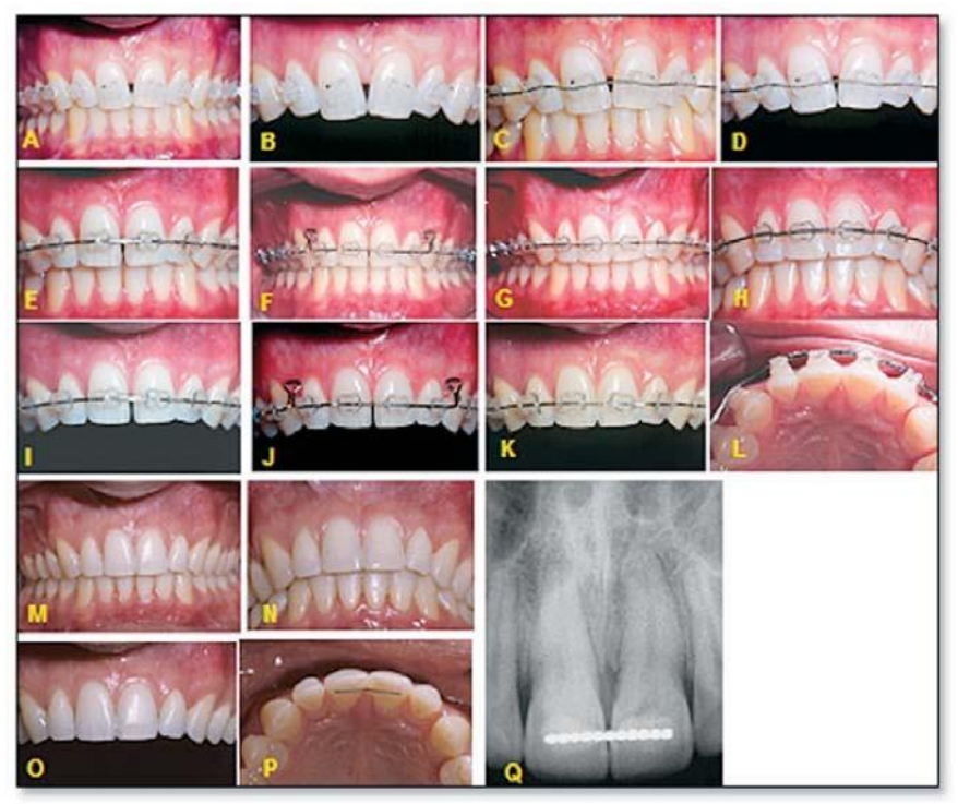
Figure 2. A-D. Re-treatment with the brackets positioned correctly and a .0175" coaxial arch wire correcting the problem at initial stages of treatment. E-L. Rectangular arch wires with closing loops associated with elastomeric chains helped to close the black triangle. M-P. Finished case with teeth inclination achieved. Spaces maintained distally of lateral incisors for composite restoration. Q. Ideal root parallelism and retention wire bonded on the lingual surface of maxillary central incisors.

Figure 2 shows the correct way to close a "black triangle" and achieve root parallelism when orthodontic brackets were positioned correctly, along with a 0.0175 coaxial arch wire at the initial stages of treatment. Closing loops associated with elastomeric chains were used. Ideal root parallelism was achieved and retention was provided by a wire bonded on the lingual surface of maxillary incisors.