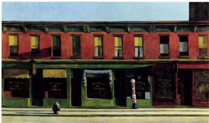
Edward Hopper (1882-1967) Early Sunday Morning , 1930 Oil on canvas 35 3/16 x 60 1/4 in. Whitney Museum of Art, New York Purchase, with funds from Gertrude Vanderbilt Whitney