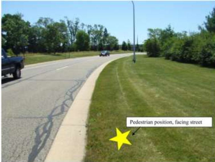
Figure 1. Set up of pedestrian listening position for study 1.

The road was a two lane, one way paved road leading away from the engineering complex at Western Michigan University. All vehicular traffic not part of the study was made up of vehicles leaving the engineering campus. The road was far enough away from any buildings so that there was no effect on sound localization. The point where participants stood was a mid-block crossing with no signalization or other traffic control but a place where a person might reasonably be expected to cross from a central park area with walking paths to a business complex. All participants walked back and forth across the roadway before starting the study so that they could make informed crossing decisions.