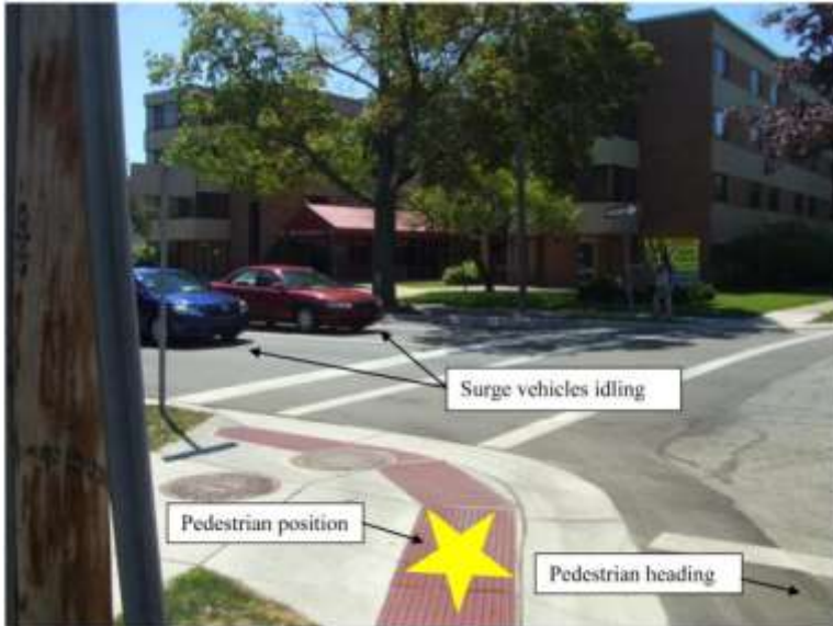
Figure 2. Pedestrian listening location for study 2 showing idling vehicle location.