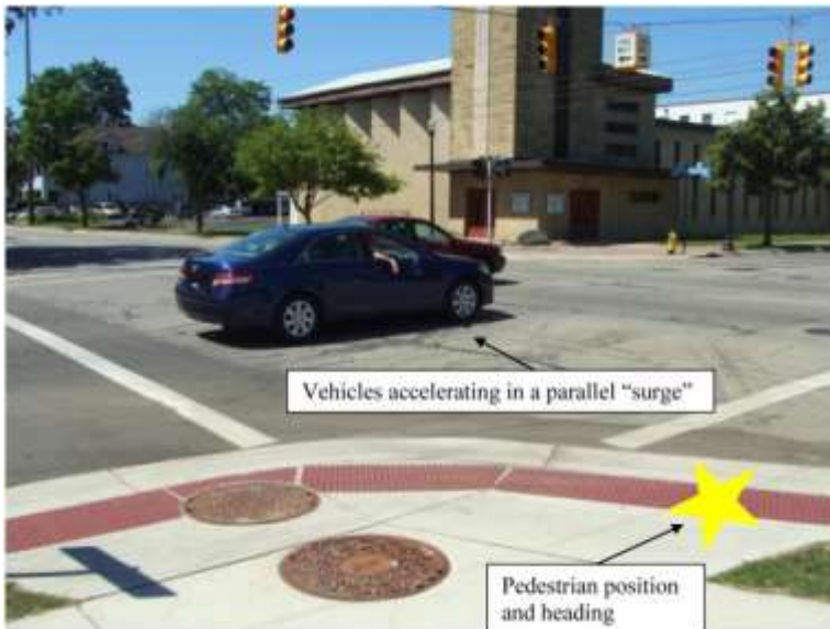
Figure 3. Pedestrian listening location for study 2 showing location of accelerating vehicles.

Confederates in Honda Civic, Toyota Prius, and Ford Escape hybrid vehicles circled the area to come up behind participants on the EW street at red lights, wait until the light turned green, then accelerate as they would normally and proceed through the intersection. Drivers were asked to try, as much as possible, to come