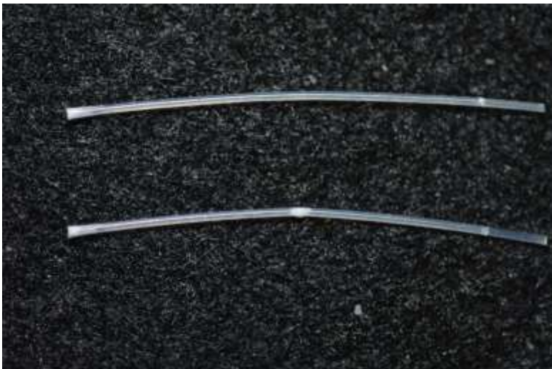
Figure 2. Comparison of non-crazed (top) and crazed (bottom) fibre-reinforced composite archwire.

Similar activation and deactivation curves, for the pre-deflection and post-deflection bending profiles, were found in the BioMers control group as well as the BioMers 1mm deflection group (Figure 1e and 1f). The differences in the pre-deflection and post-deflection activation and deactivation values were not statistically significant ( P > 0.01 ; Tables 1 and 2) for the majority of comparisons. For those that were statistically significant, the values of the stiffness and force values were within 97 per cent of each other in the control group and within 90 per cent in the BioMers 1mm deflection group. Statistically significant ( P < 0.01 ) differences in all of the pre-deflection and post-deflection stiffness and force values, during activation and deactivation, were evident in the BioMers 2mm deflection group (Figure 1g). The BioMers 2mm deflection group failed to deliver consistent forces as 80 per cent of the wires experienced varying amounts of crazing during the 30-day deflection period (Figure 2). Thus, the post-deflection force levels measured in the BioMers 2mm group were highly variable and the mean value was approximately 46–48 per cent of the pre-deflection force levels. The activation and deactivation force levels for the few wires that did not experience crazing were close to pre-deflection values, whereas the crazed wires exhibited large decreases in activation and deactivation force levels.