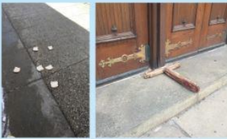
Above Left: Outside the US Bank Building downtown Above Right: Outside Gesu Catholic Church on Campus

This project was inspired by phenomenology and stale bread . The philosopher, Emmanuel Levinas, changed the way I perceive the world altogether with his pseudo-ethical theory: the Phenomena of the Face . Levinas' theory inspired me to further consider a person's humanity and human dignity in everyday interactions, such as passing someone on the street. While learning about Levinas, I saw mysterious bread scattered across campus. With my new philosophical mindset, I saw this plethora of bread, unwrapped, lining the streets and flower boxes of Marquette's campus as some sort of statement against dignity rather than for it. I was compelled to ask the question: does the Marquette community consider Human Dignity on an everyday level?