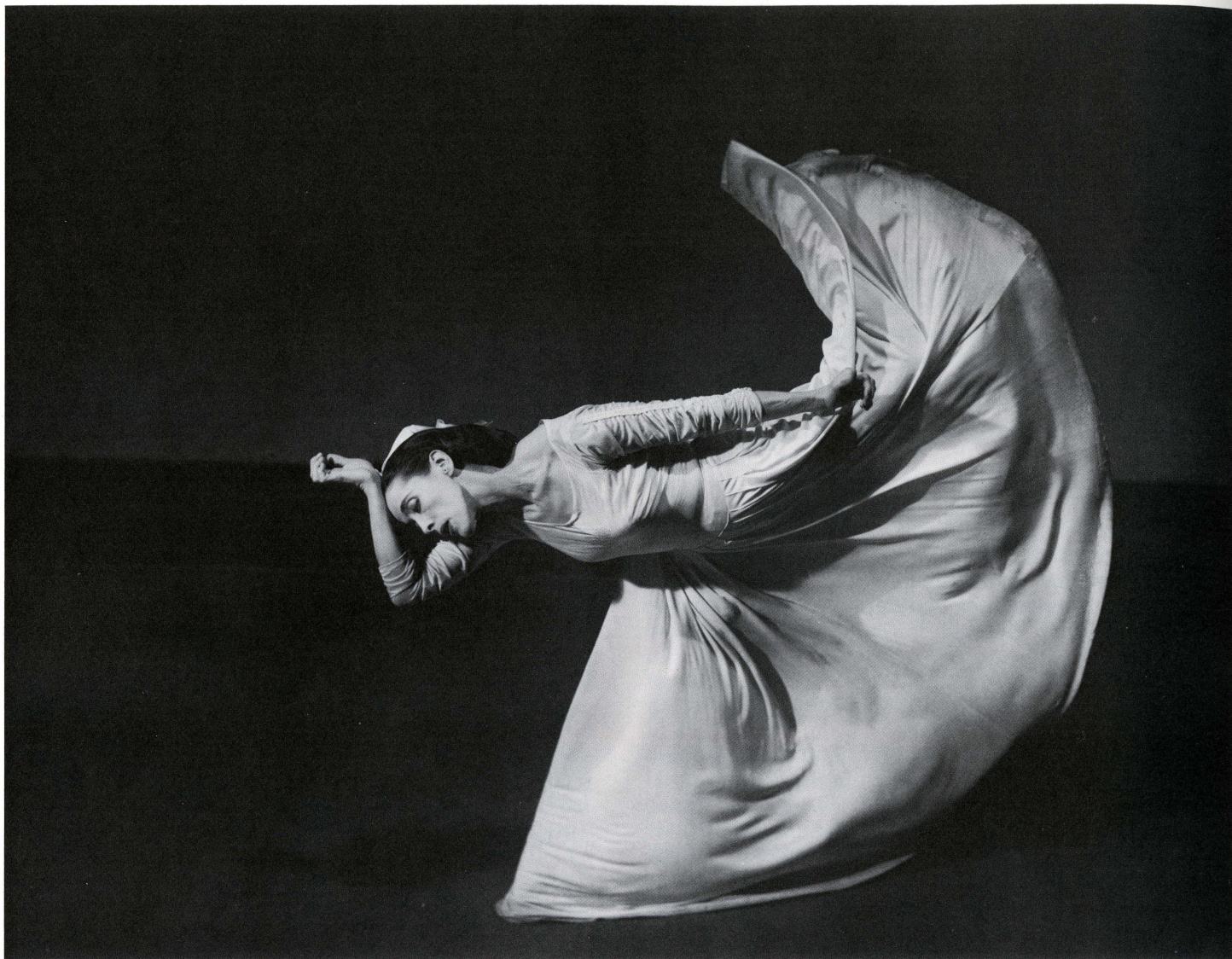
Martha Graham— Letter to the World (Kick) , Barbara Morgan, photograph

Martha Graham— Ekstasis (Torso) , 1938 (78.1.5)