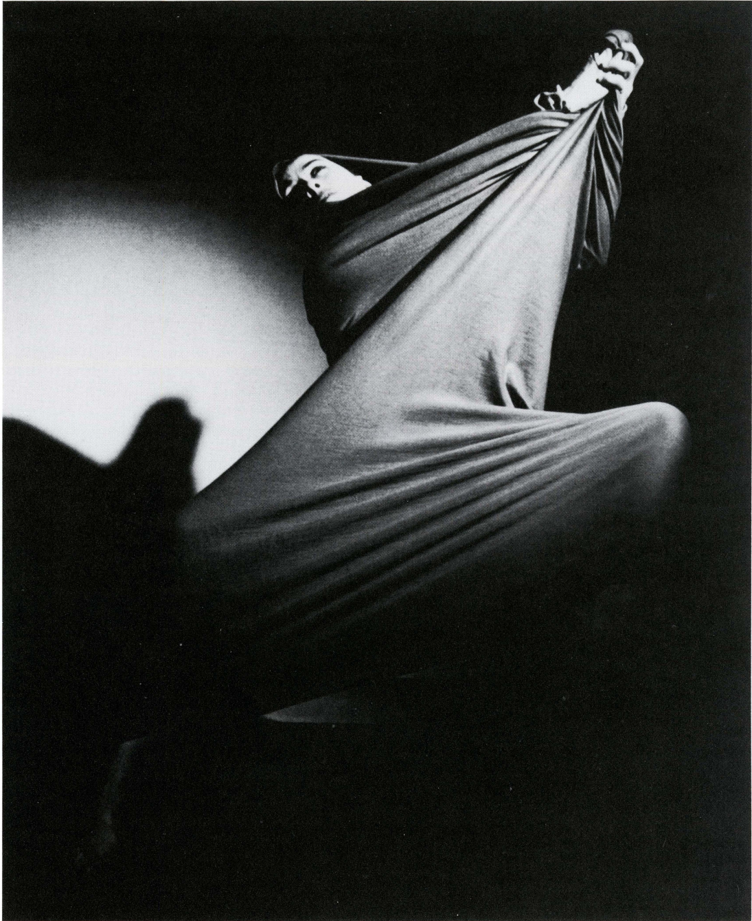
Martha Graham— Lamentation (oblique) , Barbara Morgan, photograph