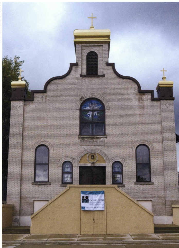
Modern exterior of Saint George Melkite church, Milwaukee, undated

The custom of arranged marriage that the immigrants brought with them from the homeland also ended with the second- and third-generation Arab American Christians, even though the American approach to mate selection was not fully acceptable. One solution was to combine both, so the younger generation met through ethnic federations and local clubs, such as the Ramallah convention, the Syrian-Lebanese Midwest convention, and other ethnic gatherings where interaction between the two sexes took place as the youth danced and socialized under the watchful eyes of community elders. 15