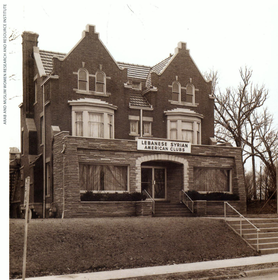
Lebanese-Syrian American Club on Highland Avenue, Milwaukee, 1960s