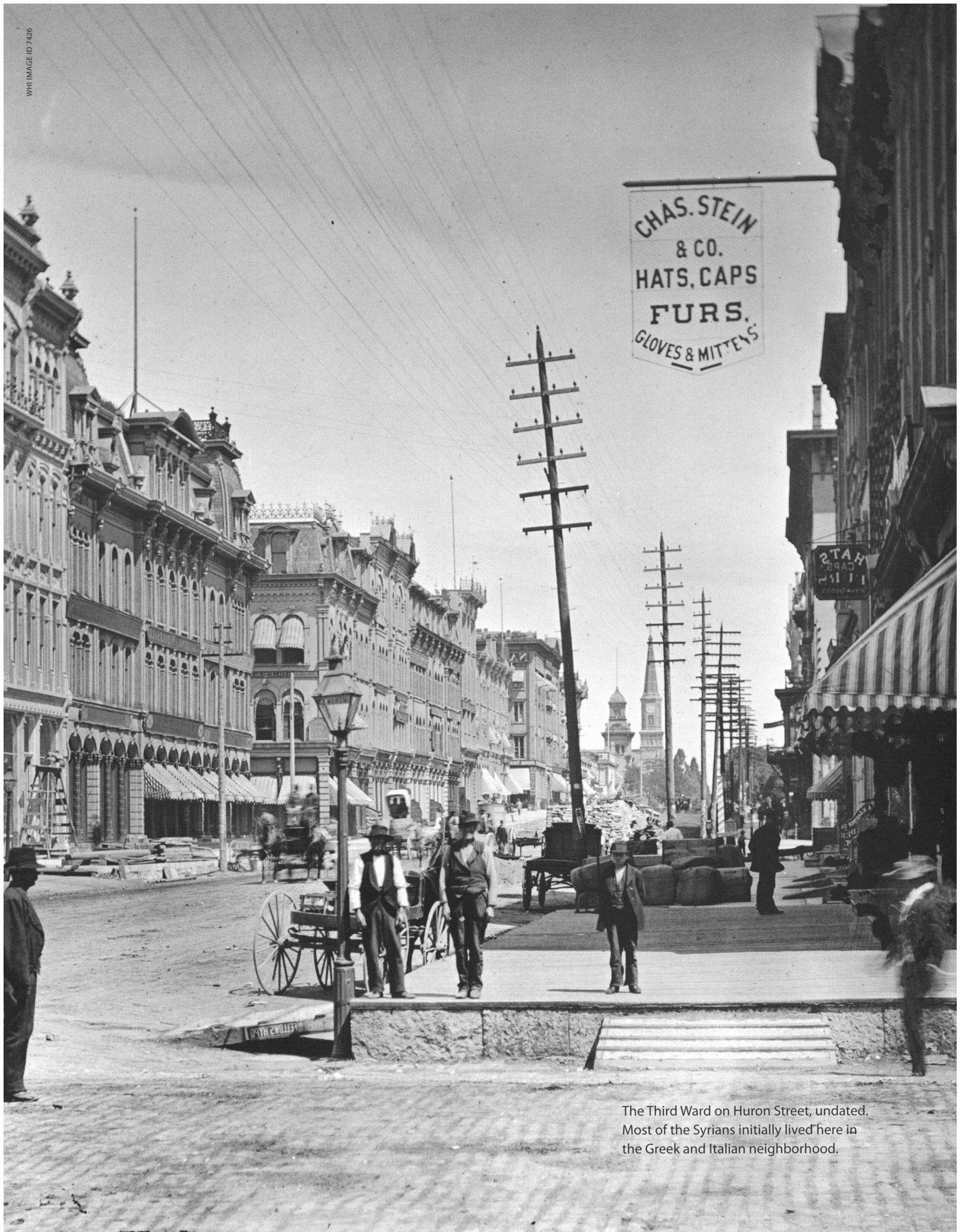
The Third Ward on Huron Street, undated. Most of the Syrians initially lived here in the Greek and Italian neighborhood.