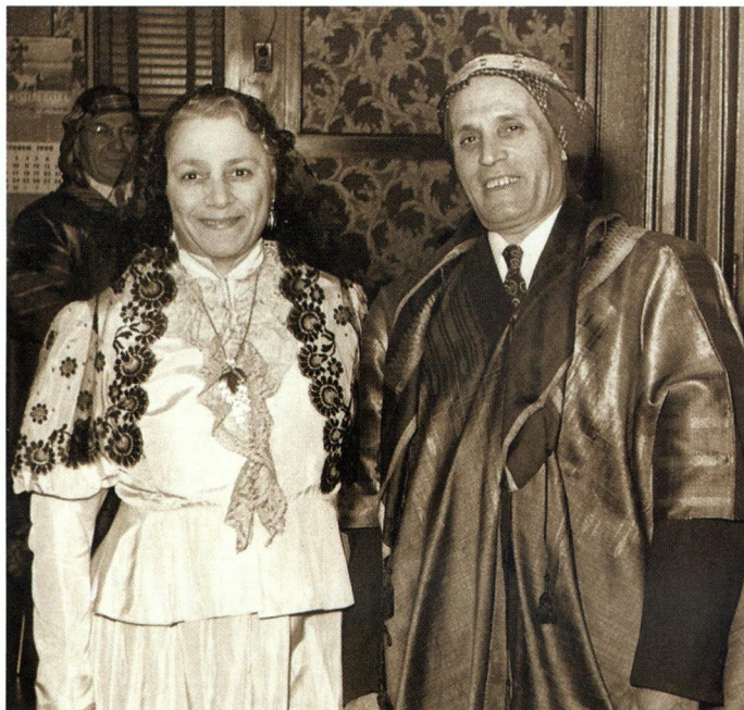
(Opposite) Modern interior photo of Saint George Melkite Church, 2013

ARAB AND MUSLIM WOMEN RESEARCH AND RESOURCE INSTITUTE