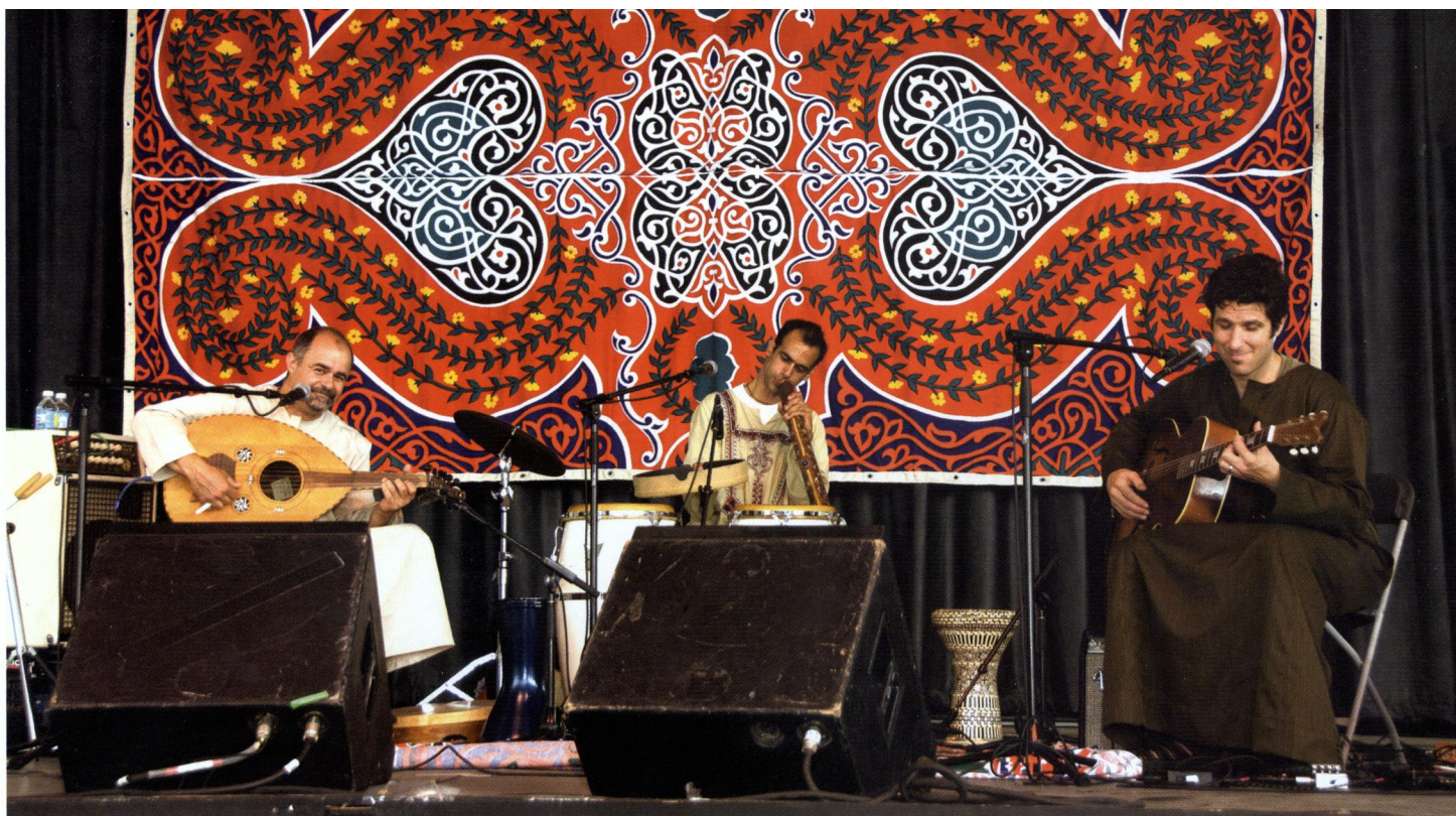
(Above) The Milwaukee band Desert Ensemble performs at Arab World Fest, undated