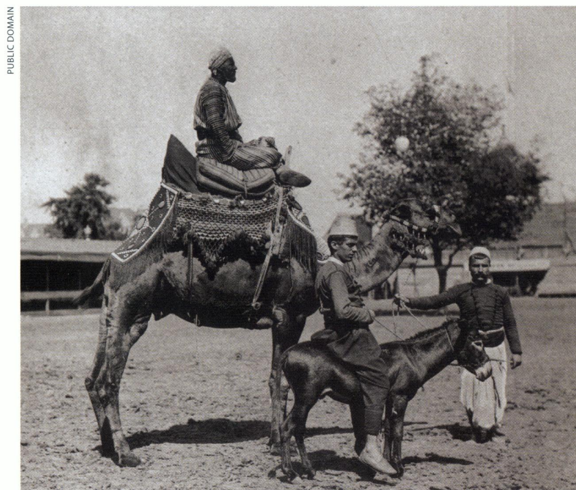
Men at the World's Columbian Exposition Arabian village, 1893