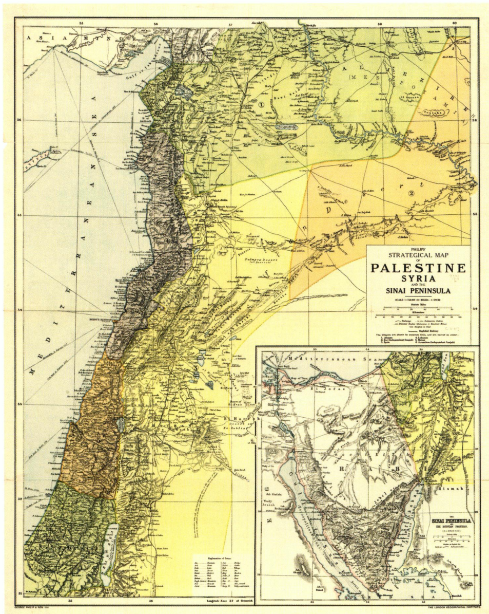
Middle East map, 1918

In 1915, among the eight hundred Syrians living in Milwaukee, ninety percent were Melkite. 15 The Syrian community maintained its ethnic and religious identity by preserving its Eastern faith and keeping close ties with extended family members and fellow villagers. The community founded the oldest Middle Eastern Church in Milwaukee, Saint George Melkite Church, to establish their religious and social organizations.