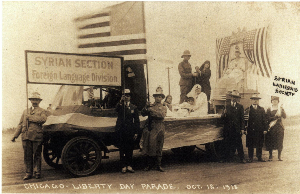
(Left) Syrian section at the Chicago Liberty Day Parade, 1918