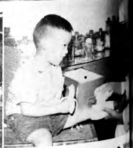
Where the Packages Go