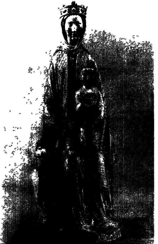
Museum of Fine Arts, Boston 12th century French Madonna and Child.

Yet Mary's submissiveness is coupled with un-