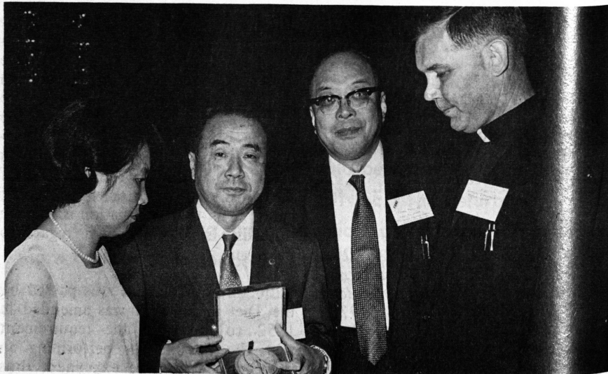
Japanese Physicians display Pope John XXI Award.

prevalent today, very often is followed by another pregnancy. Therefore, the operation usually must be repeated frequently if it is to be effective for the limitation of births. This necessarily incurs undesirable effects upon the health of the mother. (M. MURAMATSU, op. cit. , p. 38.)