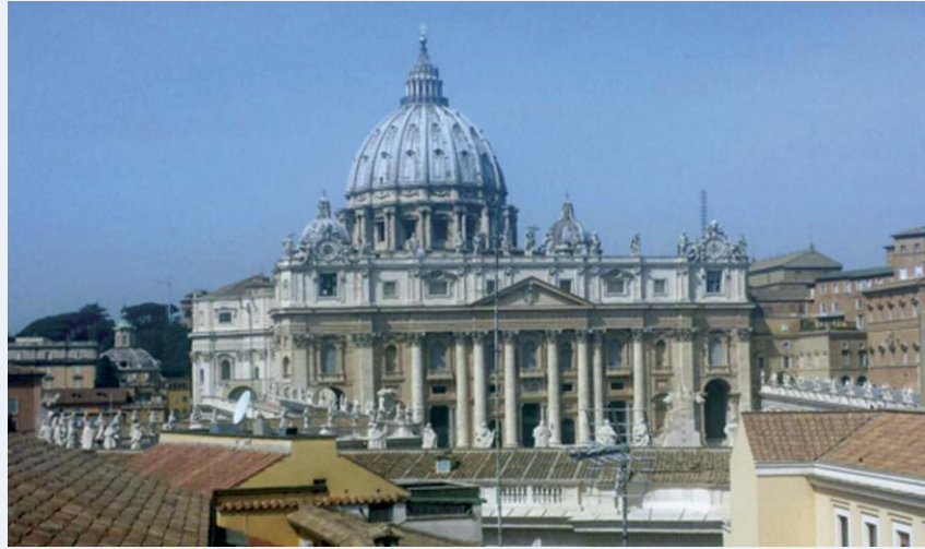
The view of the dome of St. Peter's from the Jesuit Curia's roof.

After the election of a new general, the delegates consider “matters of greater moment” in the life of the order. A committee will have met to compose a document describing