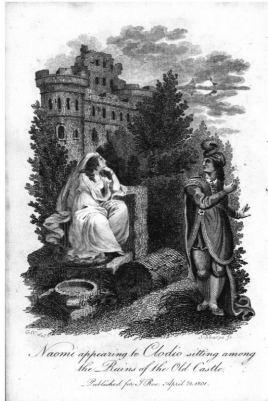
Example of a frontispiece for addition to the Gothic Archive.

More in-depth textual analysis and text-mining will be made available through the use of text-encoding initiative (TEI). This was not possible due to constraints of the Digital Commons software during the first phase of the project. Transcription and markup of the chapbooks using TEI will be time-consuming; the text will need to be proofread closely, and tags assigned. Some of that work has already been done; the transcripts mentioned earlier will be useful during the encoding process. Fortier will continue to work with Digital Commons support to encourage adoption of TEI capabilities.