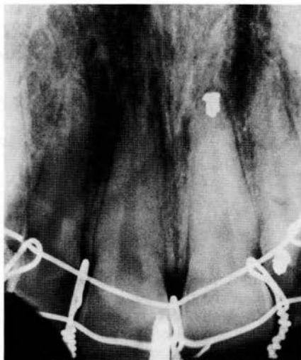
Fig. 2 Maxillary left central incisor was ligated in position with stainless steel ligature wire. The apex was sealed with amalgam, however no other endodontic procedures were performed at this time

ligated in position with stainless steel ligature wire (Fig. 2). Slight adjustment of the maxillary left central incisor was necessary to remove the tooth from occlusion. The patient was then placed on V-Cillin K (400,000 units, qid for ten days), Ananase (100,000 units, qid for four days), and Empirin No. 3 (prn pain).