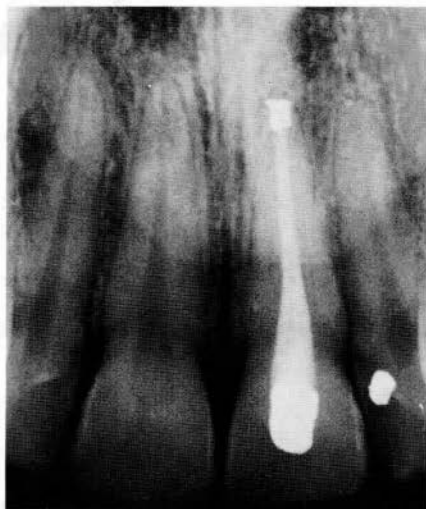
Fig. 3 After more than 3½ years, the radiographic picture confirms the clinical observation: a maxillary left central incisor, normal in appearance, with no apparent pathology present