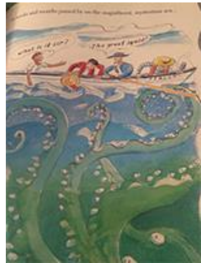
Figure 7 http://allandrummond.com

In Drummond's illustration of the scene concerning the squid, the animal's appearance is bright green with whimsical tentacles suctioning onto the Pequod's port and starboard sides. Drummond's rendition provides an easily identifiable, cartoon-like depiction of the creature (Figure 7). Unlike the tension in Stella's squid, Drummond's gentle washes of primary color appeal to the youthful eye, and the lack of structured, bold line work suggests a tone of ease and tranquility. In opposition to the original intentions of Melville's description of the squid as cream-colored and an