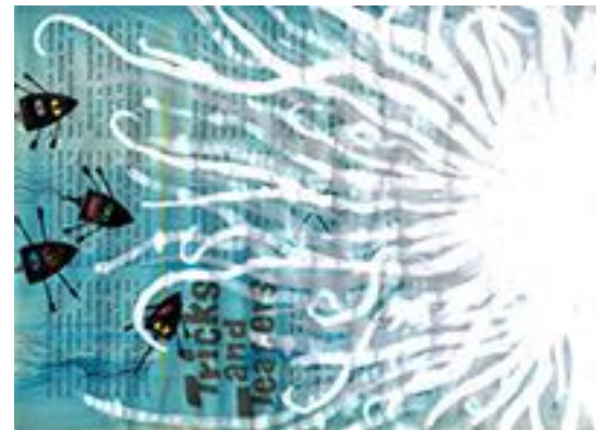
Figure 5 http://everypageofmobydick.blogspot.com

Another work of Kish's that is based on Chapter 59, takes inspiration from the same passage that Stella's print The Squid is centered on. This piece is titled " The four boats were soon on the water; Ahab's in advance, and all swiftly pulling towards their prey. Soon it went down, and while, with oars suspended, we were awaiting its reappearance, lo! in the same spot where it sank, once more it slowly rose. Almost forgetting for the moment all thoughts of Moby Dick, we now gazed at the most wondrous phenomenon which the secret seas have hitherto revealed to mankind. A vast pulpy mass, furlongs in length and breadth, of a glancing cream-color, lay floating on the water, innumerable long arms radiating from its centre, and curling and twisting like a nest of anacondas, as if blindly to clutch at any hapless object within reach. No perceptible face or front did it have; no conceivable token of either sensation or instinct; but undulated there on the billows, an unearthly, formless, chance-like apparition of life " (Figure 5). In