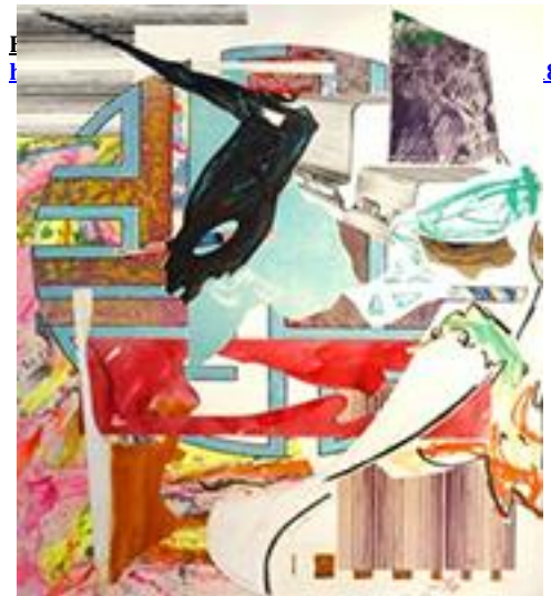
Figure 3 http://www.artnet.com