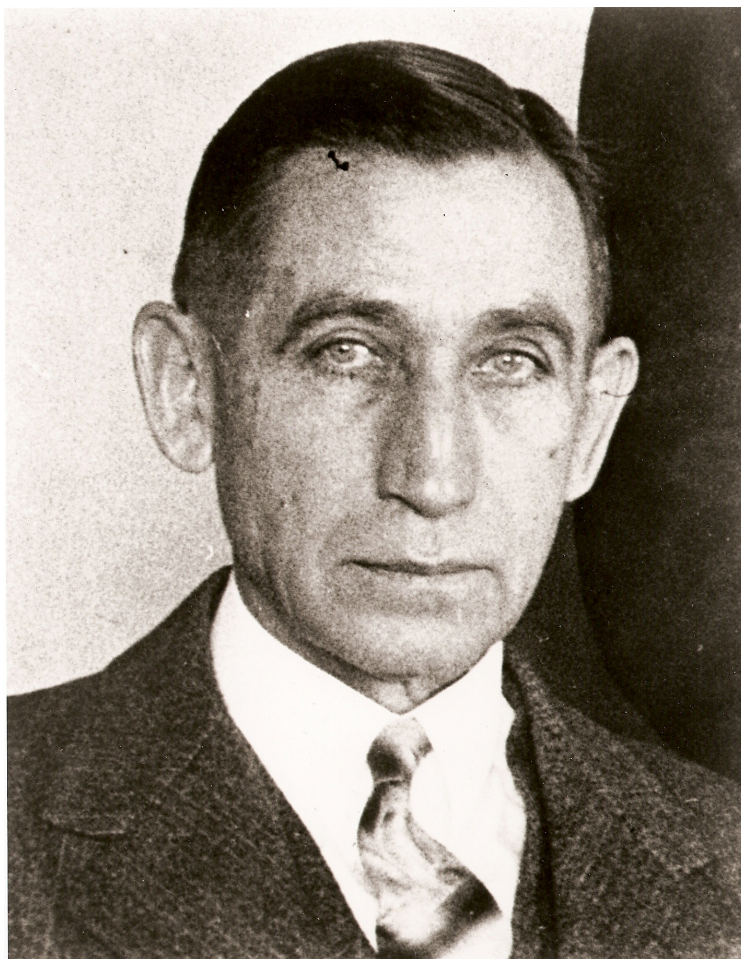
Eugene Octave Sykes (1934) 68

someone declare that a certain commissioner, identified only as a “long-eared, long-nosed, tight-lipped son of a bitch,” would tell the examiner how to write his report. All familiar with the physiognomy of the FCC commissioners assumed that the speaker could only have been referring to Judge Sykes. 67