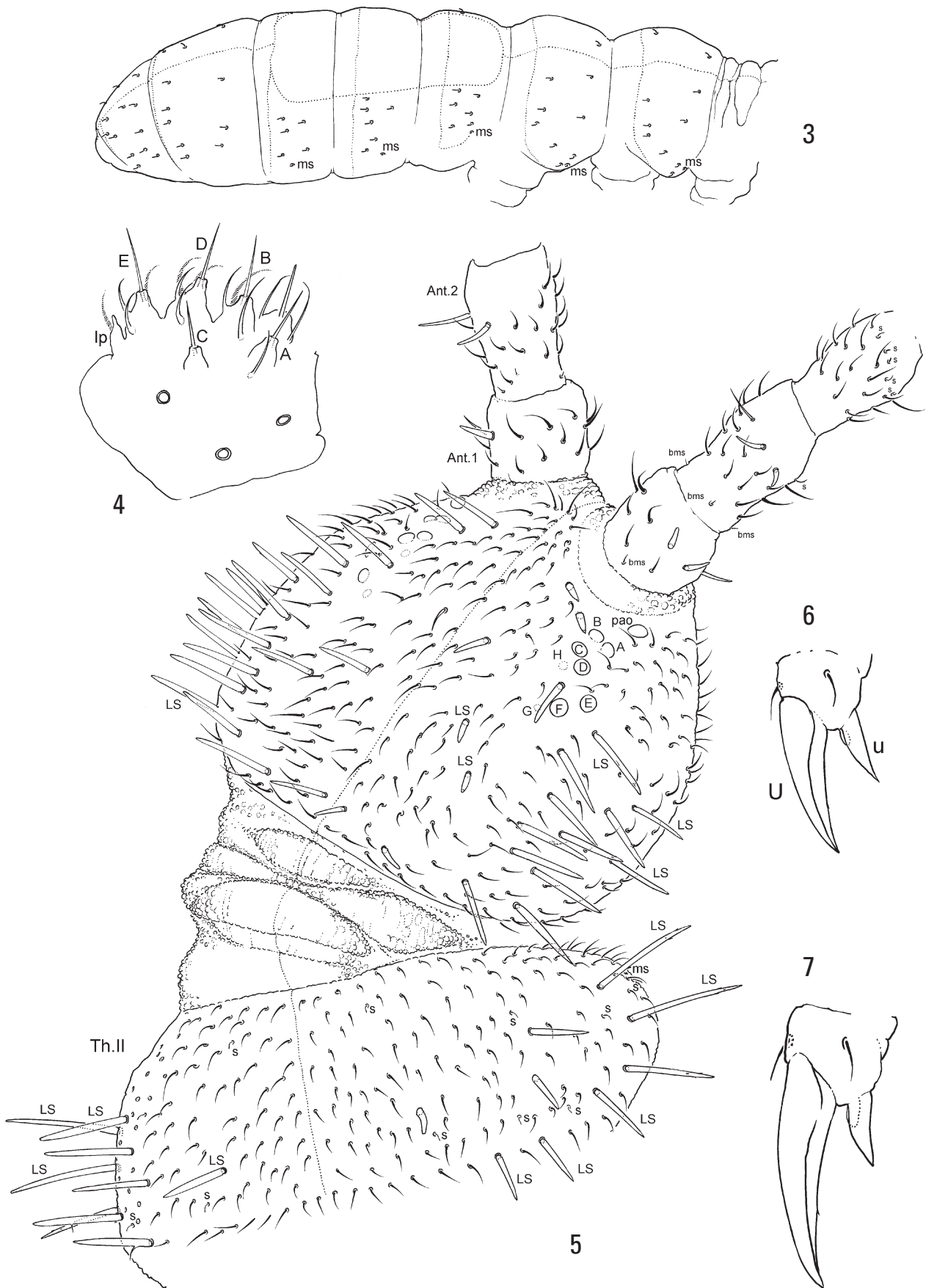
Figs. 3–7. Isotopenola sp.n., epitokous male. 3: Distribution of (macro)sensilla and microsensilla on body (area on abdomen devoid of sensilla is marked). 4: Labial palp (A–E – labial papillae). 5: Dorsal chaetotaxy of head (A–H – ocelli) and Th.I–II (sensillum positioned most laterally on Th.II is not shown). 6, 7: Apical part of leg 3 in female (6) and adult epitokous male (7).