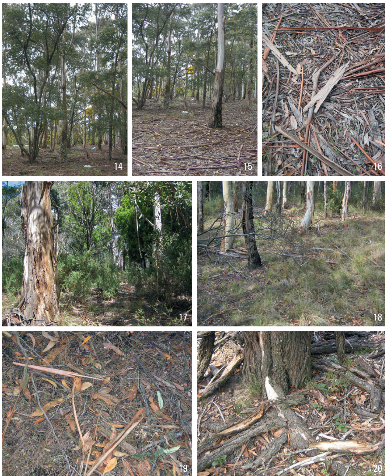
Figs. 14–20. Photographs of habitats at Ballarat where Isotopenola perterrens were found. 14–16: Type locality (plantation). 17–20: Source area of remnant vegetation and part of the ground cover.