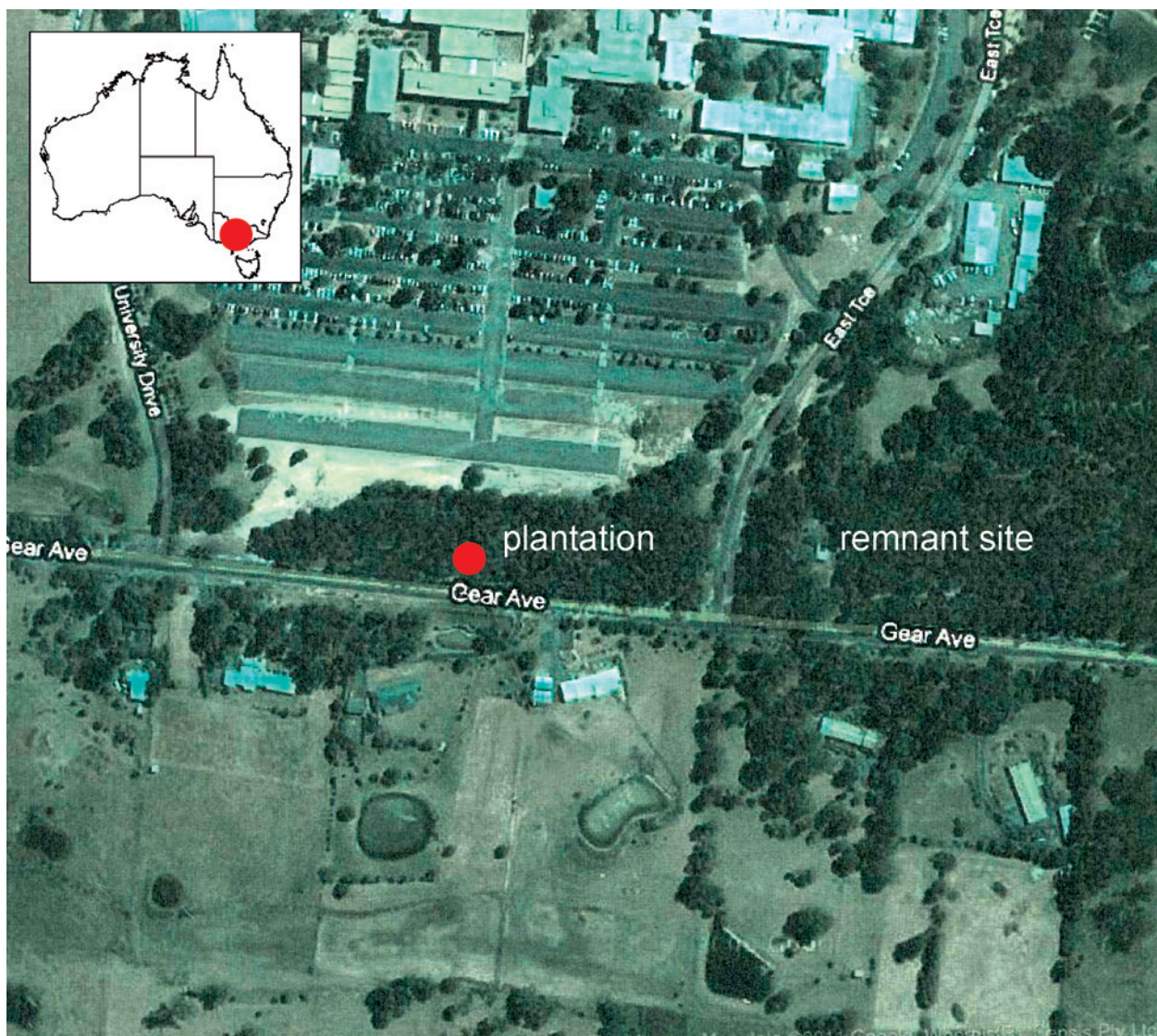
Fig. 13. Map showing location of type locality (plantation) and adjacent patch of remnant vegetation at Mt Helen.

posterior half of Abd.IV was observed. Depending on specimen, the position and number of spines vary (often asymmetrically) but they maintain the general pattern of distribution described above. Ordinary chaetae of the body are short resulting in the chaetotaxy of epitokous males being strongly differentiated into thick, straight, large spines and short chaetae (Fig. 8). This contrast is more striking on the thorax and anterior half of the abdomen. Lateral parts of Abd. IV and latero-ventral and ventral parts of Abd.II–VI bear long bristles arranged in groups (Figs. 1, 2). As these chaetae extend laterally the habitus of epitokous males appears to be more dorsoventrally flattened than in non-reproductive individuals. The unguiculus in epitokous males is somewhat shorter, i.e. ratio unguiculus : unguis = 0.37–0.44 in epitokous males and 0.5–0.54 in females and non-reproductive males (Figs. 6, 7). Chaetotaxy of females and non-reproductive males is unmodified with numerous, both short