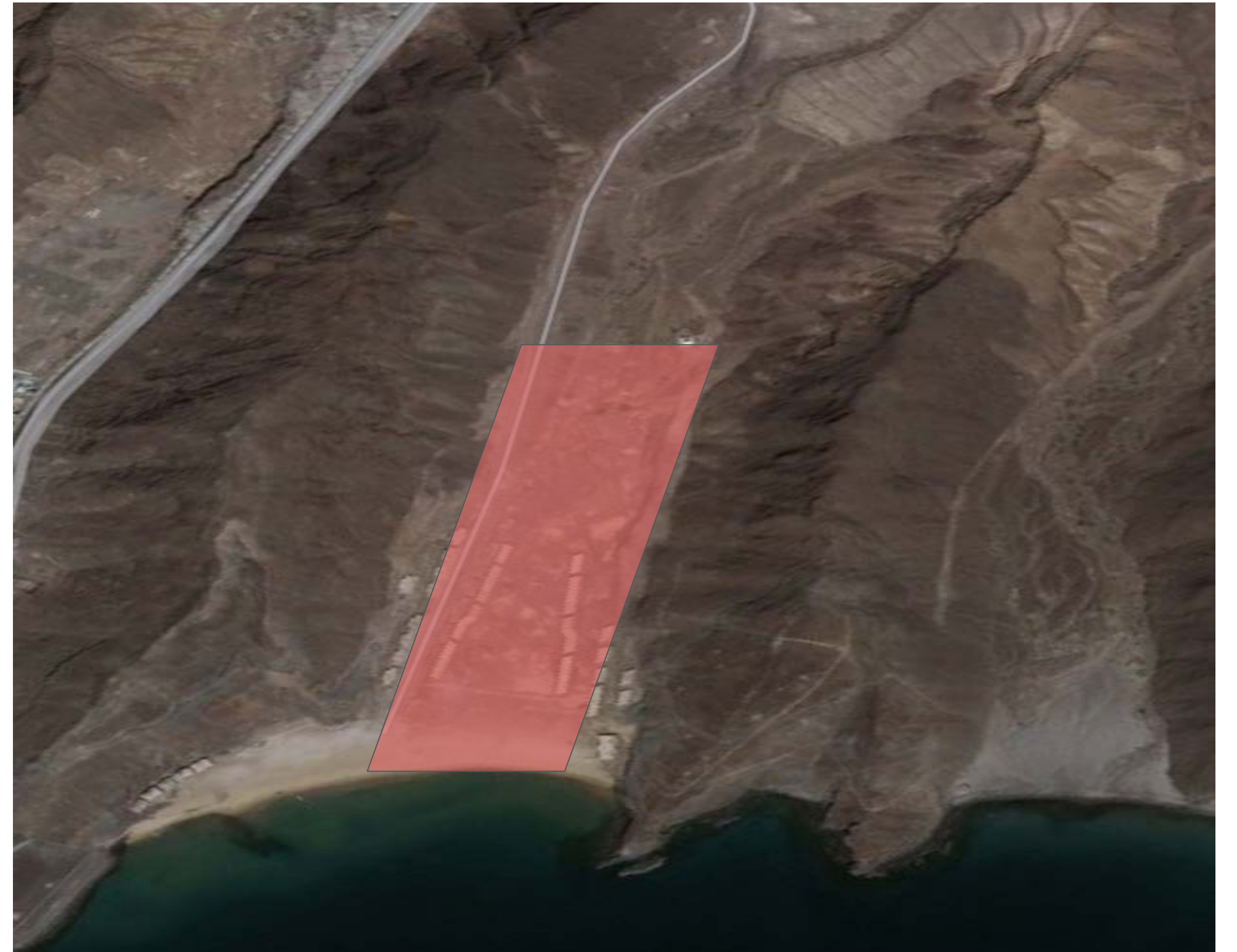
Exact Site Location

Result: Destruction of infrastructure and famine -> more IDPs