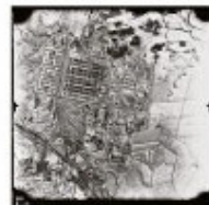
Birkenau extermination camp, Poland 1944