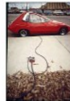
"Sundancer" electric car, 1973