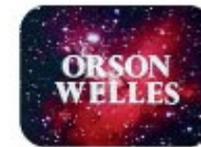
"Who's Out There?" NASA video, 1975