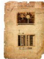
Eli Whitney's patent for cotton gin, 1794