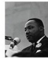
"I Have a Dream" speech, 1963