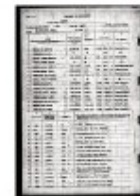
U.S. Navy roster, 1942 not digitized