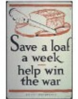
World War I print, 1918