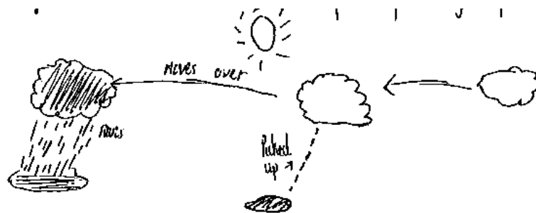
Figure 2. Drawing of relocation of water to a site other than that of the agent (no physical change in the nature of the water).