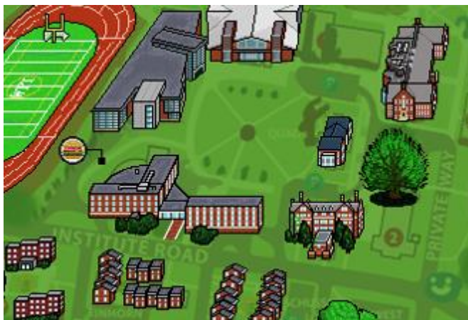
[Figure 6: the official map of WPI Campus, overlaid with hand-made sprites]

Getting the buildings to be identifiable and accurate to life was challenging. The original draft of the map was a painted-over version of the stock WPI campus map found in any brochure distributed by the school. This was an extremely helpful tool, as it accurately laid out all the footprints of the local roads and buildings. With those in place, the next step was accumulating reference photos. The app's isometric view meant that buildings would be viewed from the South-East. We went around campus, taking photos of every important building from the southern face and eastern face. This way we could more easily capture the likeness of the building, such as its color, window placement, window count, and architectural details. Preexisting satellite views of campus also helped with making sure its shape in our app was true to life.