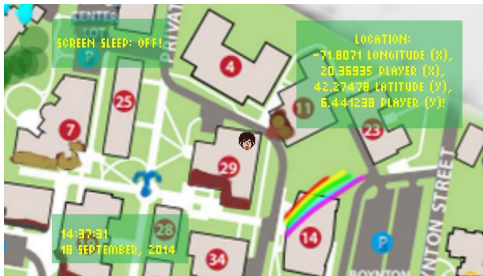
[Figure 3: providing useful positional feedback to the player]

The purpose of this function is produce an output value that is offset the same relative amount along a new range as the input value was along its initial range. In practical terms, this simple mathematical function allowed us to take a raw GPS coordinate that was between the previously-recorded extrema and rescale it to a relative position on a much smaller map, which is exactly what we did.