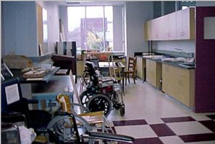
The ATRC at WPI

Email: atrc@wpi.edu Phone: 1-508-831-6056 Address: Room 129 of Higgins Labs WPI, 100 Institute Road Worcester, MA 01609