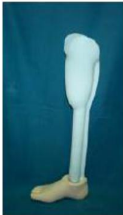
Figure 1. The Monolimb with a Prosthetic Foot

countries. The team tested each foot in different stages of a gait using finite element analysis (FEA) and physical testing to compare effect of two prosthetic feet. The FEA determined the stresses and strains within the monolimb and the foot caused by the forces present during gait. The physical testing was used to determine the strains caused by different loads on the foot. Results of both tests showed that the SACH foot performs better than the SR foot when coupled with the monolimb. The team found that the SACH foot is able to compress more in all orientations than the SR foot, giving it more flexibility.