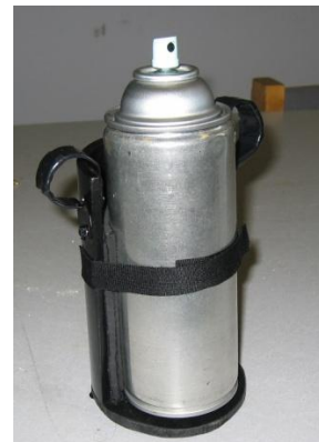
Figure 5. Adapted spray can holder

A maintenance man and finish carpenter who works for a commercial property owner and general contractor had an accident that resulted in portions of two fingers on his right hand being amputated. This loss of function in his dominant hand limited his ability to perform the task of using aerosol spray cans at his job. As a course design project, three student groups worked on this problem and developed three different solutions. The user tested all of them and chose the design that only involved his thumb and pinky finger to hold the can and allowed him to use his middle finger to activate the spray (Figure 5). He currently uses this device at his job.