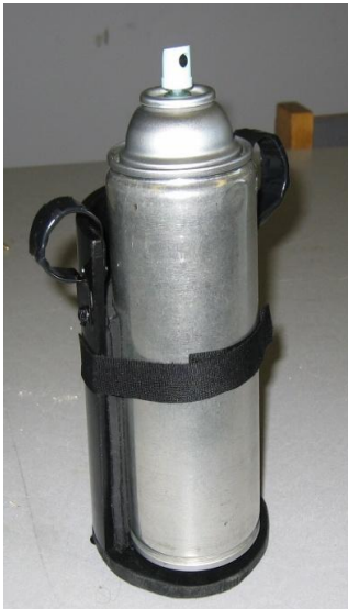
Figure 4: Adapted spray can holder