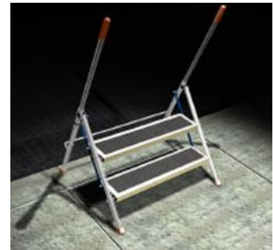
Figure 3. Accessible step stool

Several individuals with disabilities are transported between their homes and daily workplaces in large vans, but many find it difficult to enter the van because of the distance between the ground and the base of the van. The step stools on the market do not provide enough stability to the user because of the small tread area on the base of the stool. In order to solve this problem, a course design project at WPI was completed through the ATRC to improve accessibility of multi-passenger vans. Student groups developed prototypes that were sturdy, easy to store, and safe to handle. One prototype that was developed was a collapsible step stool with extended rods for users to grip for stability (Figure 3).