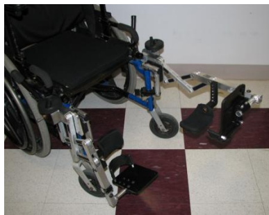
Figure 2. Elevating legrest on wheelchair

People who use wheelchairs need to elevate their legs periodically in order to prevent loss of circulation in their lower extremities, which can cause pressure sores and swelling of the legs. With currently available legrests, wheelchair users are often unable to elevate their legrests independently. Even when a caregiver helps them, the limited extension of the legrest may not entirely alleviate the problem. A graduate student created a new design for an elevating legrest that