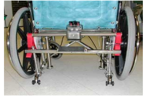
Figure 1. Glide control mechanism on wheelchair

The Monson Developmental Center 1 approached the ATRC with the request for a device to eliminate a hazardous condition for a wheelchair user with cognitive disabilities and autism. The patient enjoyed propelling himself backwards at high speeds, thereby creating an unsafe condition. Three WPI students developed an adjustable glide control mechanism that depended on adjustable friction belts wrapped around the hubs of the wheels (Figure 1). This mechanism prevented the wheelchair from reaching high speeds but still allowed the patient to maneuver independently (Boettcher, McLean, Sundberg, Klockars, Hoffman, 2006) 1 .