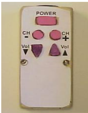
Figure 4. Adapted TV remote

Individuals with visual impairments, physical disabilities, and cognitive disabilities are often unable to operate standard TV remotes because of the complexity of the buttons. Since the adaptable