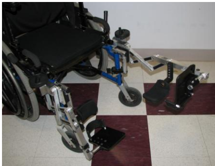
Figure 2. Elevating Legrest on Wheelchair

A.H. Hoffman, Eric D. Couture (2008), "Design and Development of an Elevating Articulating Manual Wheelchair Legrest" in Proceedings of 2008 International Mechanical Engineering Congress and Exposition , Boston, MA.