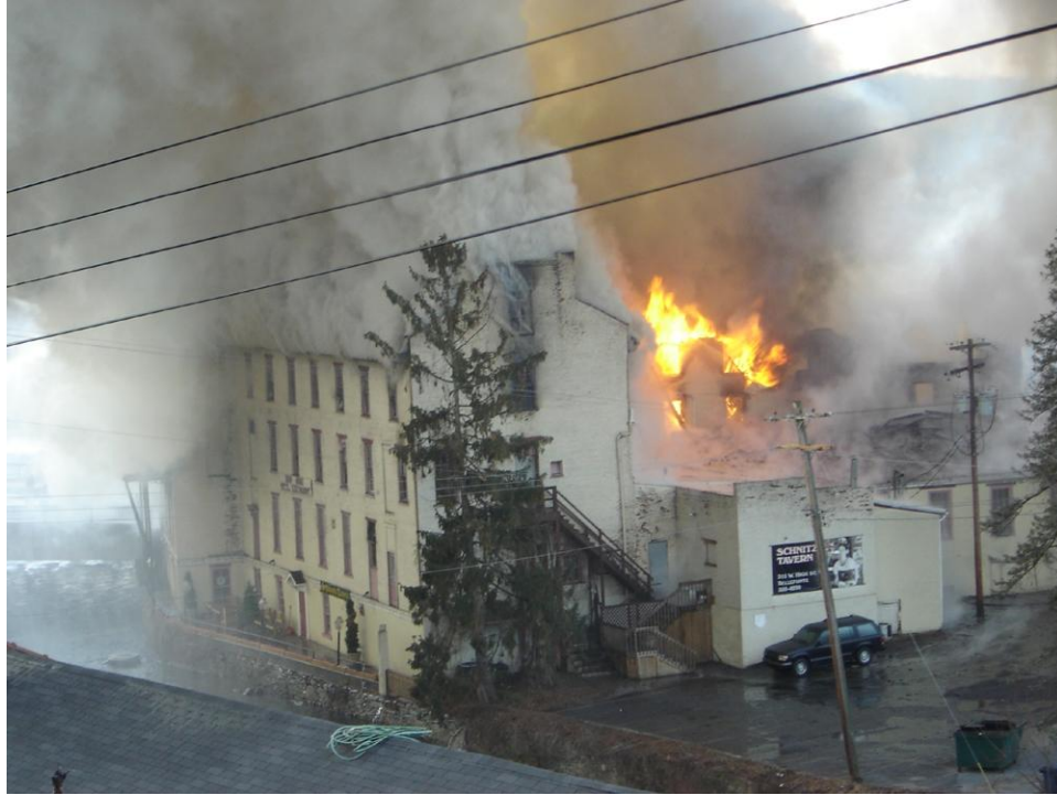
Figure 9 The Bush House Fire, Bellefonte, PA (February 8, 2006).