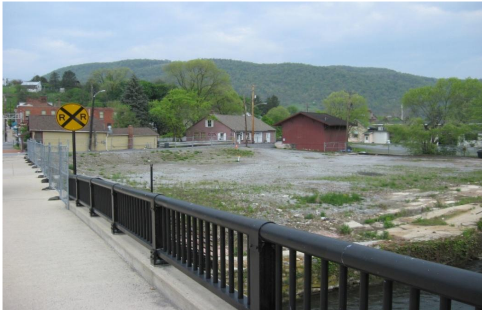
Figure 10 The Bush House Lot, Bellefonte, PA.