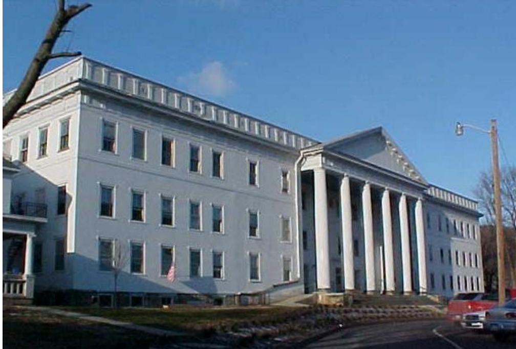
Figure 4 The Bellefonte Academy, Bellefonte PA