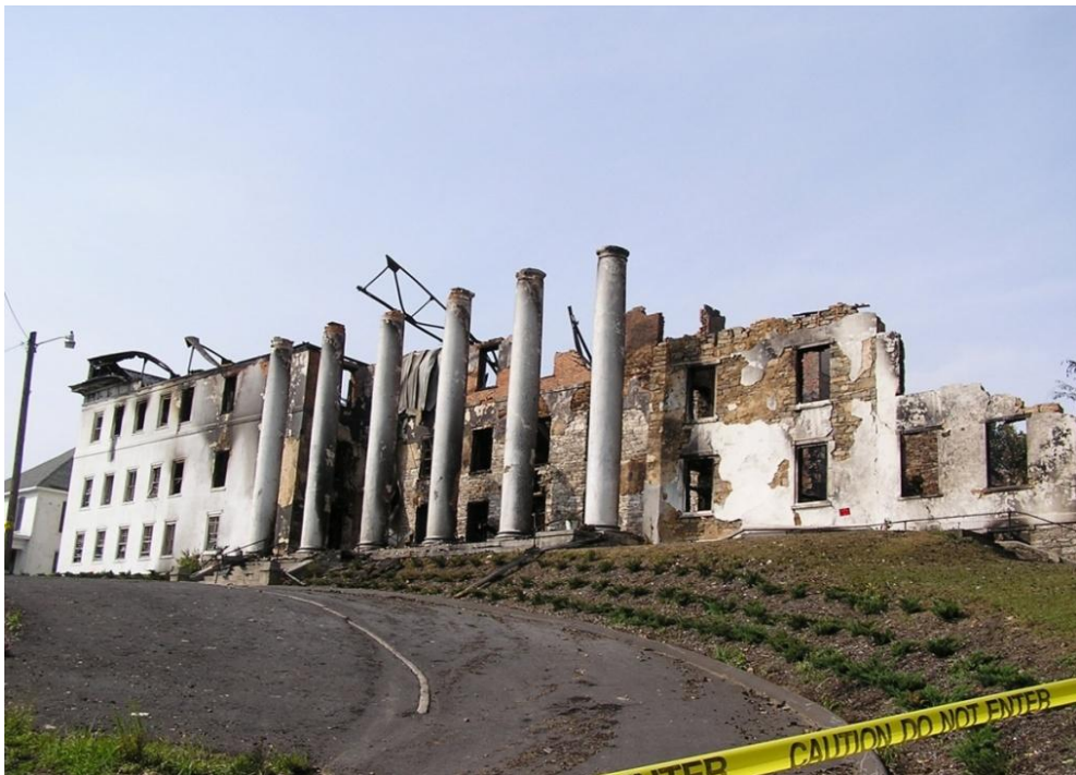
Figure 5 The Bellefonte Academy Lot, Bellefonte PA (July 14, 2004).