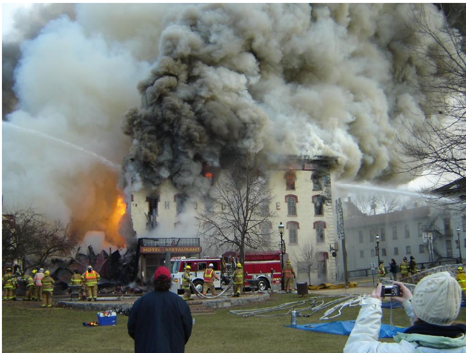
Figure 8 The Bush House Fire, Bellefonte, PA (February 8, 2006).