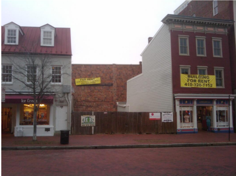
Figure 3 Site of 2005 Annapolis Fire

Since 2005, the lot where the buildings once stood remains vacant. The frame of the building on the right remains charred from the fire. The lot is in a very dense section of Main Street, so the hole that the fire left is even more prominent.