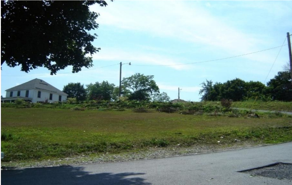
Figure 6 The Bellefonte Academy Lot, Bellefonte, PA.

The fire department had been concerned that the complex would burn down, due to its high state of disrepair and lack of a fire suppressant system, but renovation could not be enforced until early 2003. October 3, 2003, was established as the deadline to renovate the complex and correct the issues found, though this deadline was extended to July 30, 2004 (Joseph and Nissley, 2004).