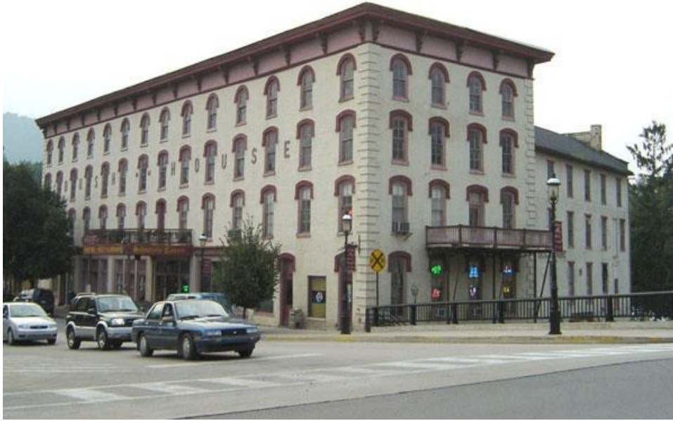
Figure 7 The Bush House, Bellefonte, PA.