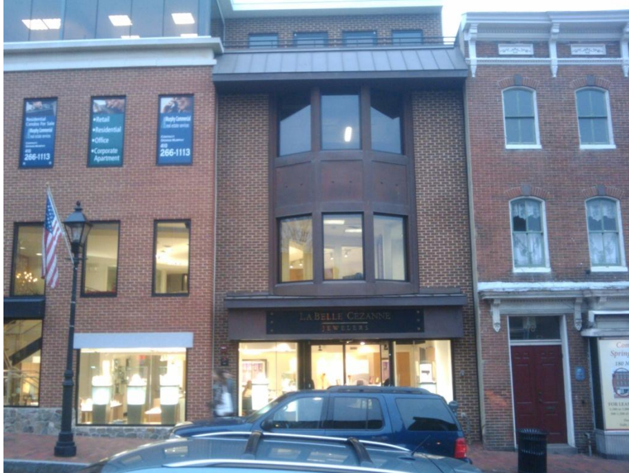
Figure 2 Site of 1997 Annapolis Fire

Unlike the original century-old buildings that once stood in its place, the newer buildings are far from historic-looking. In the building on the left, the brick is an entirely different color from the surrounding buildings. The top floor is completely composed of windows, which further detracts from the historic look of the streetscape. The first floor is also open to view because of large windows. The inside is also contemporary style, and is very visible to passersby. It does not appear that the designer even attempted to make the building fit the style of the rest of the historic streetscape. Annapolis is a nationally recognized historic district, but this building does not fit the “historic” mold that most historic districts follow.