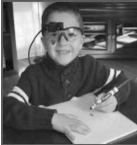
Figure 2. Applied Science Laboratory Mobile Eye-XG.

Until recently, eye trackers were stationary pieces of equipment housed in a lab and usually connected to computer screens displaying visual information such as texts and images. Advances in eye-tracking technology have yielded portable units that subjects can wear on their heads, enabling researchers to capture data as the subjects move freely through space. Figure 2 shows the Applied Science Laboratory Mobile Eye-XG, a unit that "can now collect eye movements and point of gaze information during the performance of natural tasks allowing the use of unconstrained eye, head and hand movements under variable light conditions" (Engineering Systems Technologies).