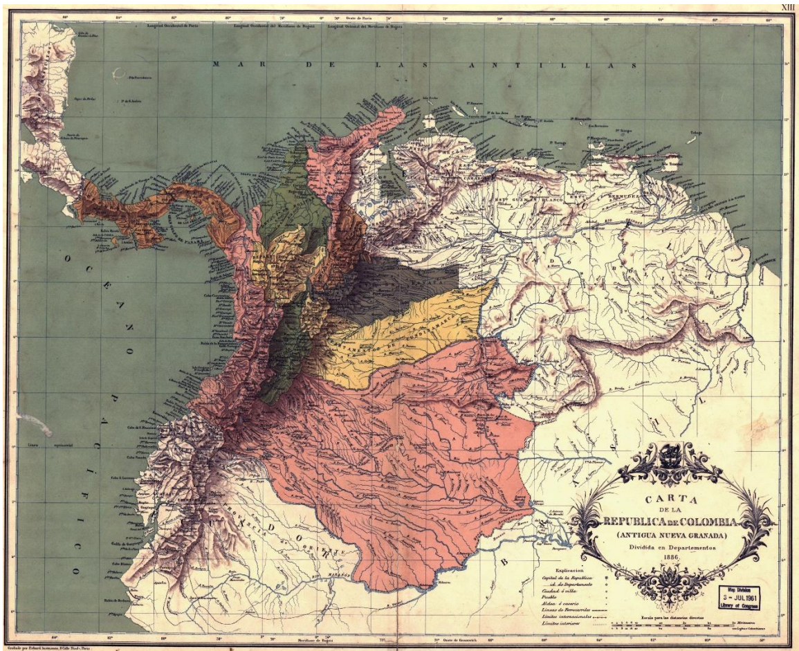
Map of Colombia, 1886. Taken from the "Atlas geográfico e histórico de la República de Colombia, 1890" by the Geographical Institute Agustín Codazzi.

Colombia is a country located in the northwestern part of South America, and as the map shows, it is divided by three mountain ranges that belong to the greater Andean mountain range (Ministerio de Salud y Protección Social 2016, 16-17). Most of the population lives in these mountain ranges, with the larger cities such as Bogotá or Medellín located in the highland valleys and plateaus, while other important cities, such as Cartagena or Santa Marta, are in the Caribbean coast. Other regions, such as the Pacific coast, the Amazonian rainforest or the eastern plains were sparsely populated