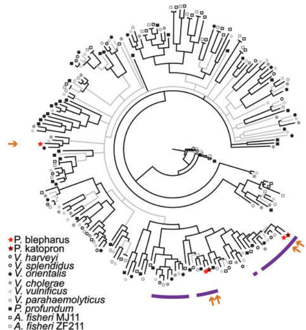
Fig. 3. —Bayesian tree based on amino acid sequences for all MCP genes found in anomalopid symbionts and the free-living relatives V. harveyi 1DA3, V. splendidus ATCC 33789, V. orientalis CIP102891, V. cholerae O395, V. vulnificus CMCP6, V. parahaemolyticus RIMD 2210633, P. profundum SS9, A. fisheri MJ11, and A. fisheri ZF211. Genes with >40% sequence identity to anomalopid MCP genes, over 40% of the gene length, were included. Branches shown in black have \geq 95\% posterior probability and branches with less support are in gray. Arrows indicate location of anomalopid symbiont sequences and purple bars denote conserved amino acid ligand binding sequence, suggesting that they may respond to amino acids in the environment (Taguchi et al. 1997; Glekas et al. 2010; Nishiyama et al. 2012; Brennan et al. 2013).

With the exception of the reduction in copy number for MCP genes, both anomalopid symbiont genomes have retained the full complement of chemotaxis and motility genes found in some free-living relatives (Hendry et al. 2014), including all genes necessary for flagellum synthesis and function and all chemotaxis genes necessary for signal transduction from MCPs to the flagella ( cheW , cheA , cheY ,