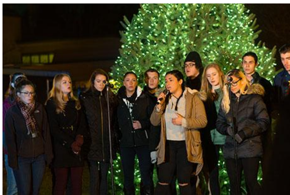
Hawkward, an a cappella group at RWU, performs during RWU's Winter Illumination in December.

Hawkward will take the stage in Providence before an audience of up to 3,000 on Thursday, March 22