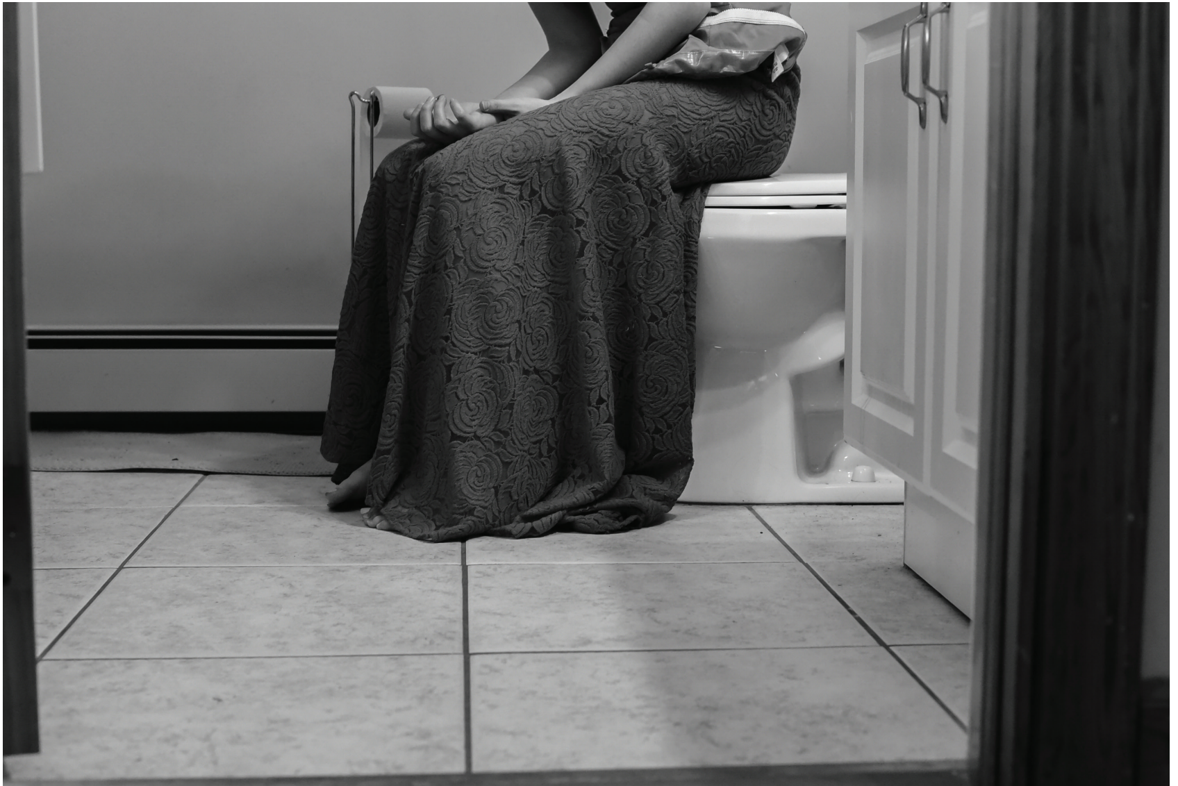
Untitled , Photograph, 8.5" x 12.5", 2018