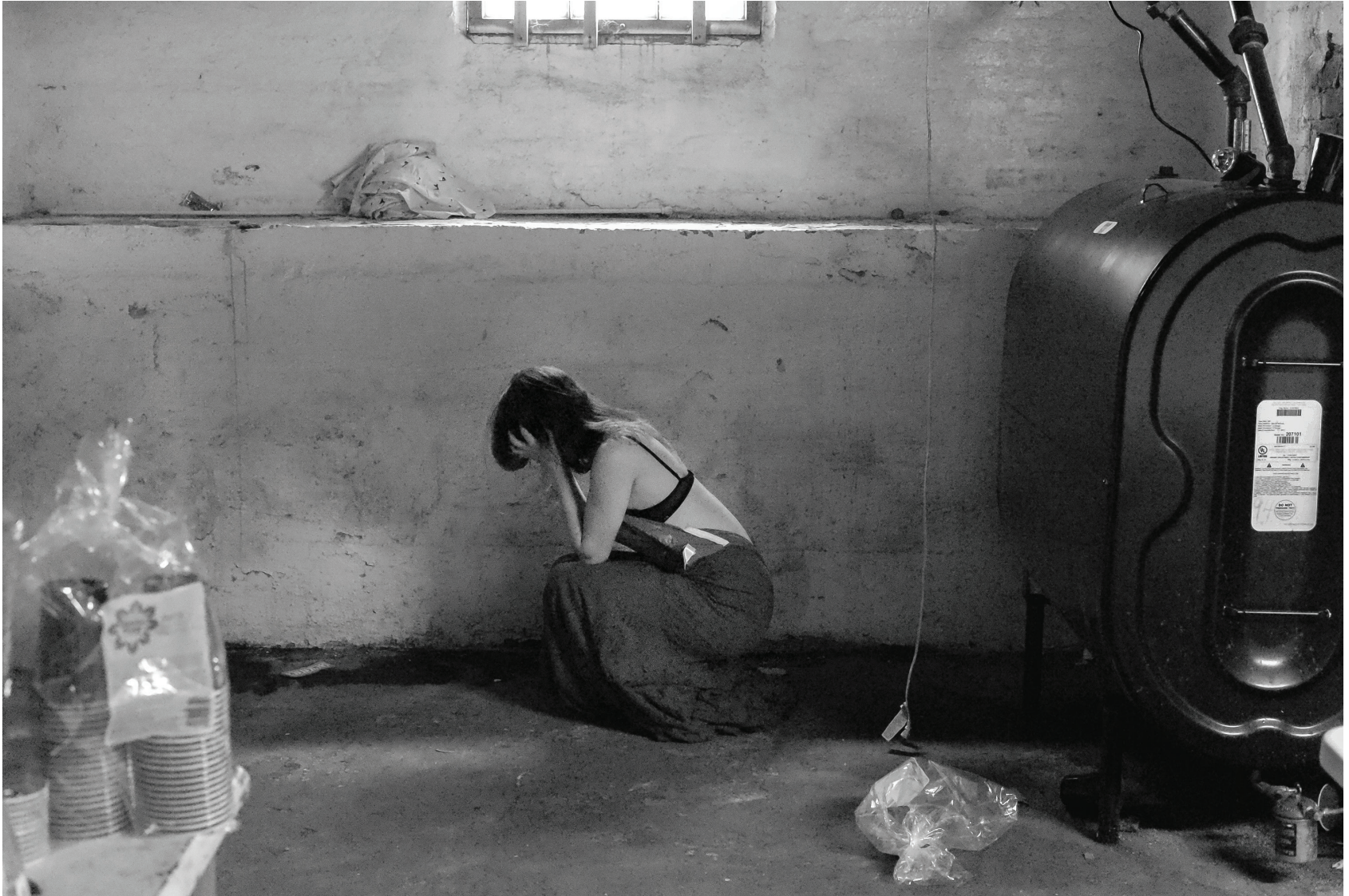
Untitled , Photograph, 8.5" x 12.5", 2018