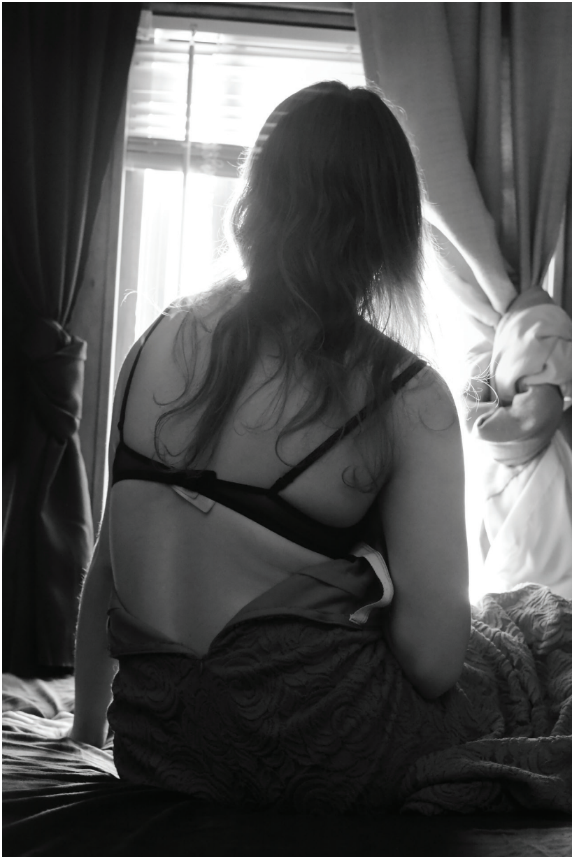
Untitled, Photograph, 12.5" x 8.5", 2018