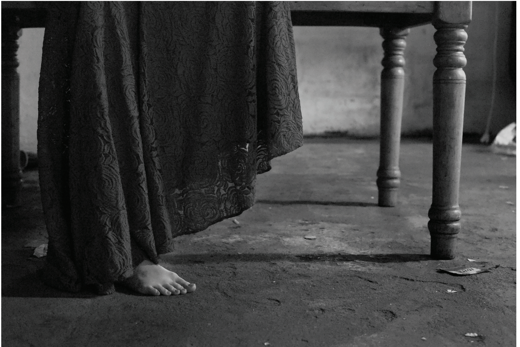
Untitled , Photograph, 8.5" x 12.5", 2018