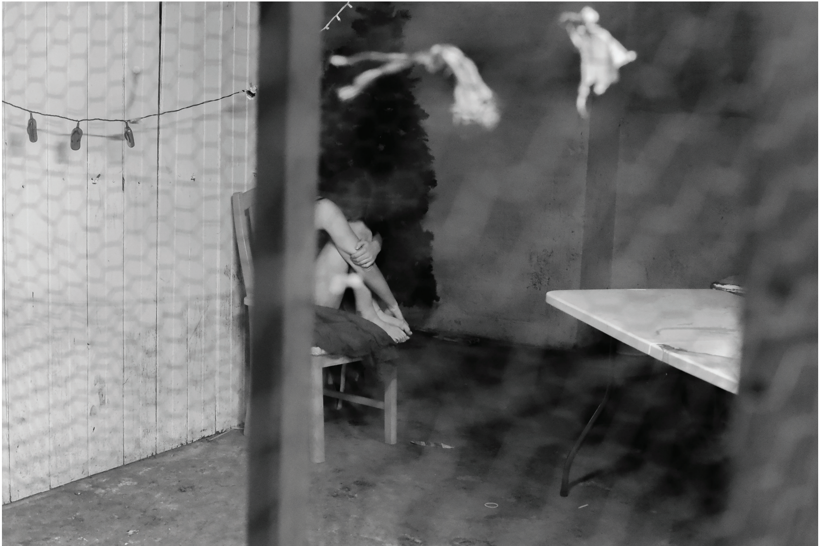
Untitled , Photograph, 8.5" x 12.5", 2018