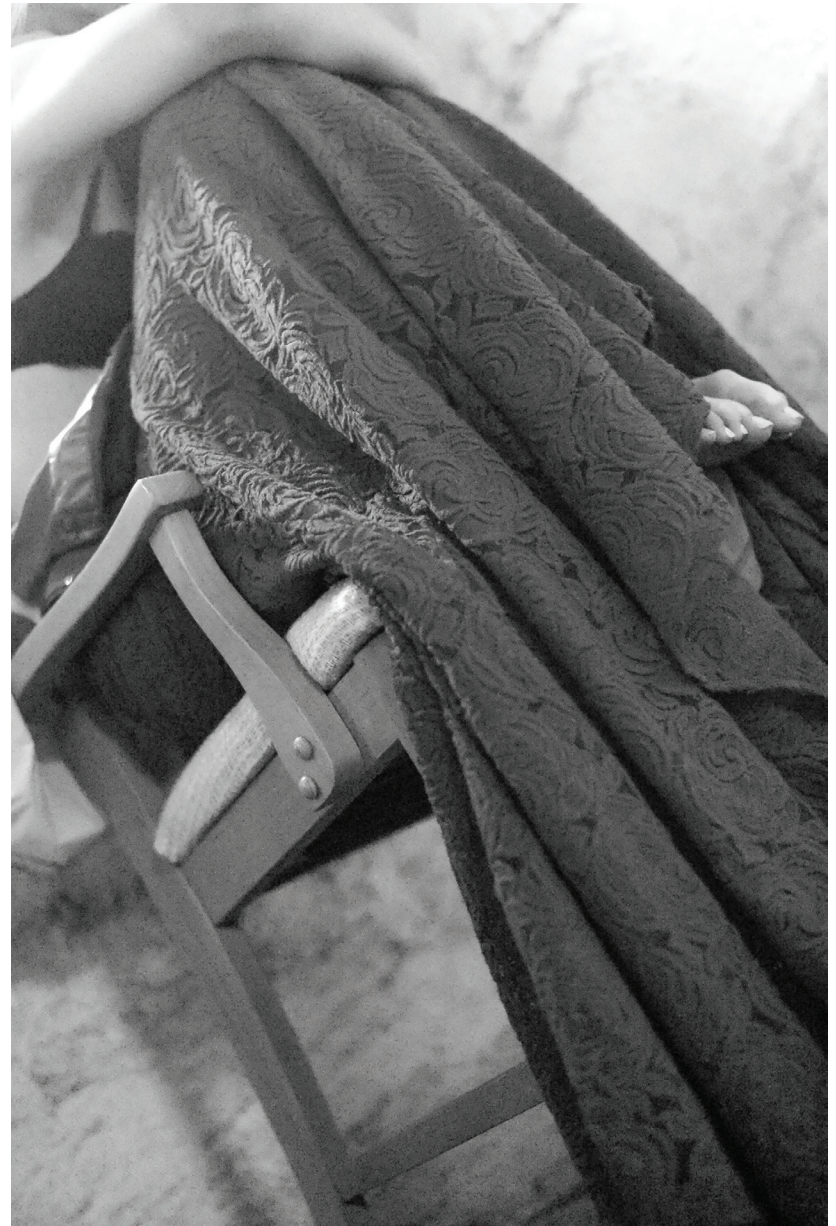
Untitled, Photograph, 12.5" x 8.5", 2018