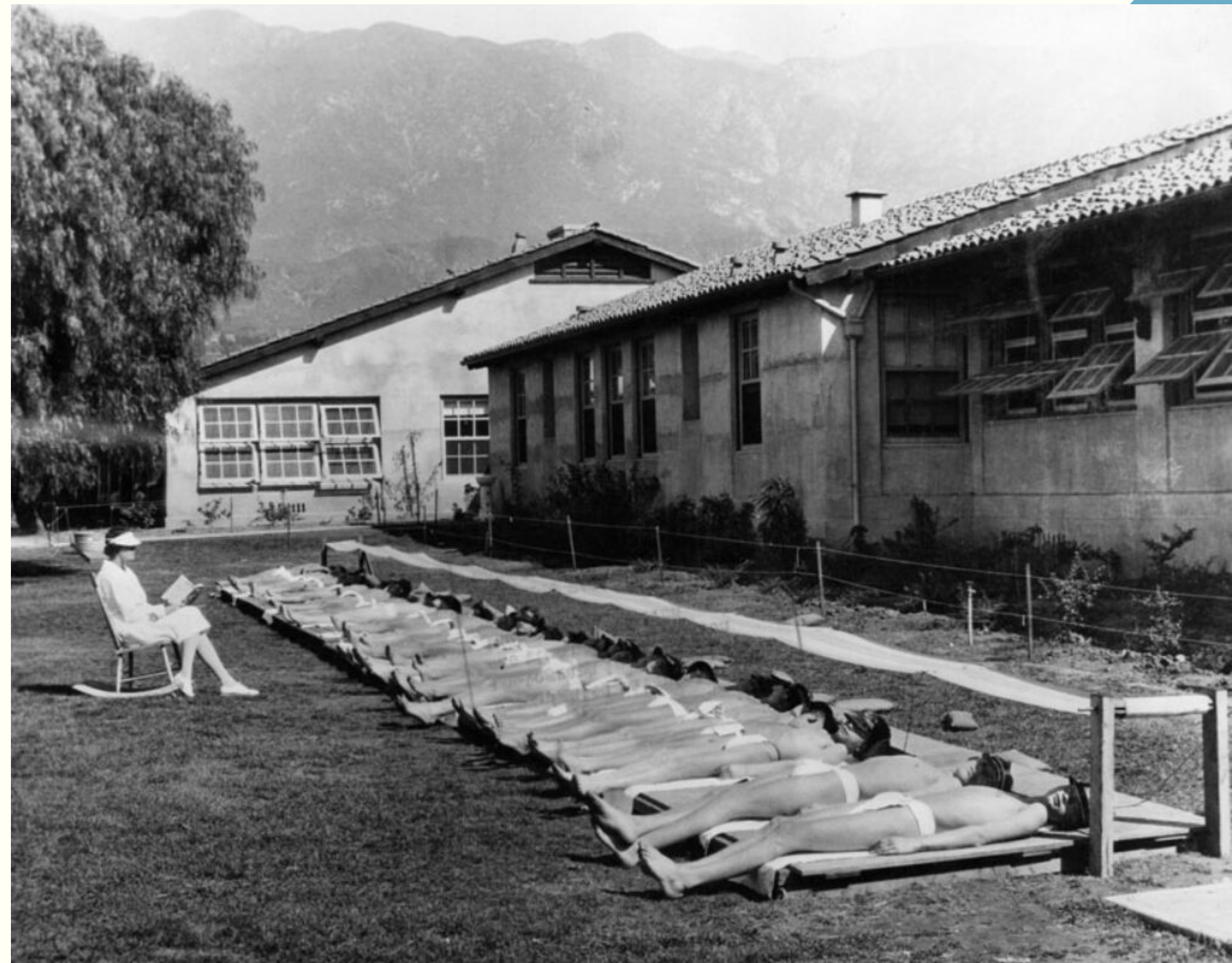
1923 Pasadena Preventorium Boys getting their daily sun exposure

a blend of sanitarium, school, and home for healthy children at risk for developing tuberculosis that emphasized fresh air and play through an indoor-outdoor environment