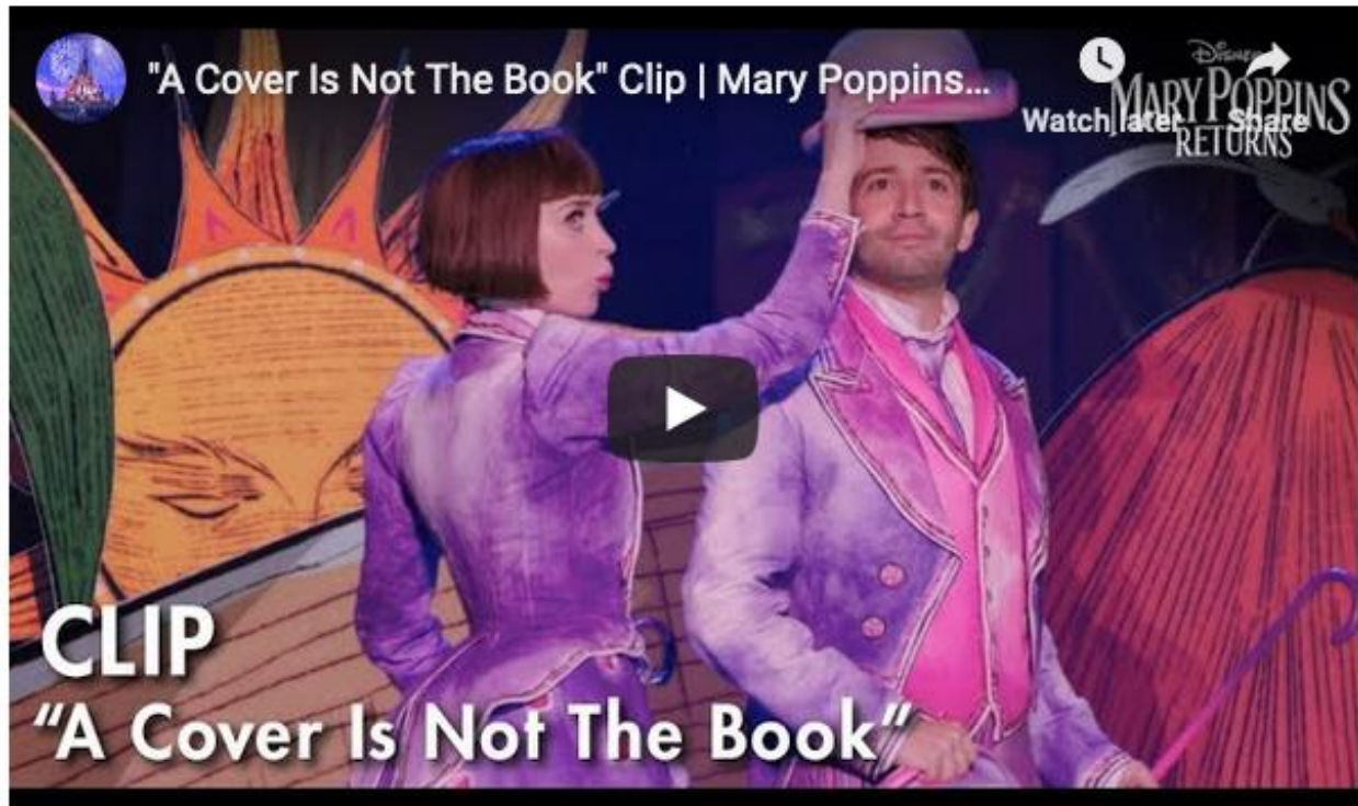
"A Cover Is Not The Book" Clip | Mary Poppins Returns