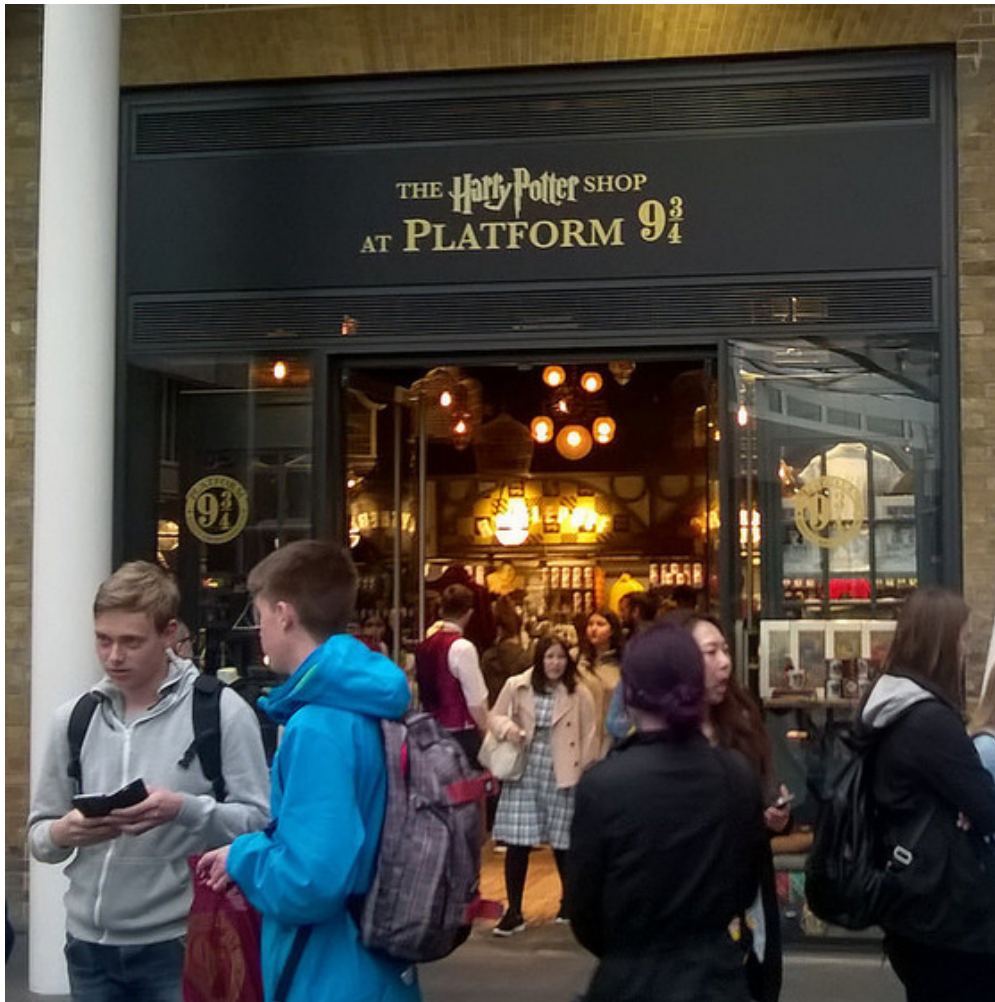
The Harry Potter Shop at Platform Nine and Three-Quarters, 2016.

This sense of inadequacy, however, stems from a category mistake. Elaine Scarry has distinguished between forms of art that give us “immediate sensory content” (painting, music, the Harry Potter films), forms that provide “instructions for the production of actual sensory content” (a written musical score, say), and—one step more removed—forms that offer “instructions for how to imagine” the sensory world (the realm of fiction and poetry). 1 A description that suggests a place “as wonderful as you might hope” looks like an impoverished version of the third category: a fiction with meager instructions for imagination, full of deictic phrases (“This is ...”) that point to a world we can’t see. But it really falls in the second category: in a rehearsal script, stage directions yield instructions for the director and designers to produce a sensory world. The second-person “you” who might “hope” isn’t you, the reader; it’s the director (though it’s hard to shake the sense that it’s also you, the tantalized ticket buyer). “Plays are like sheet music, meant to be sung,” the playwright Thorne has tweeted . Harry Potter and the Cursed Child isn’t a bad novel. It’s just packaged to look like one.