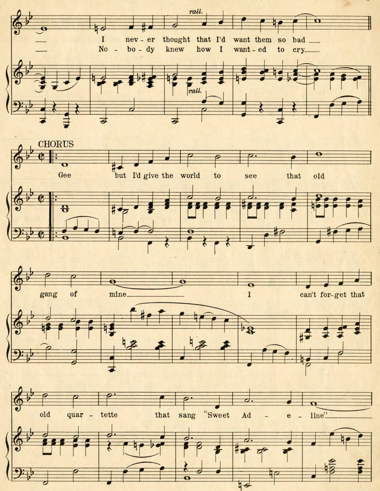
That Old Gang Of Mine - 3