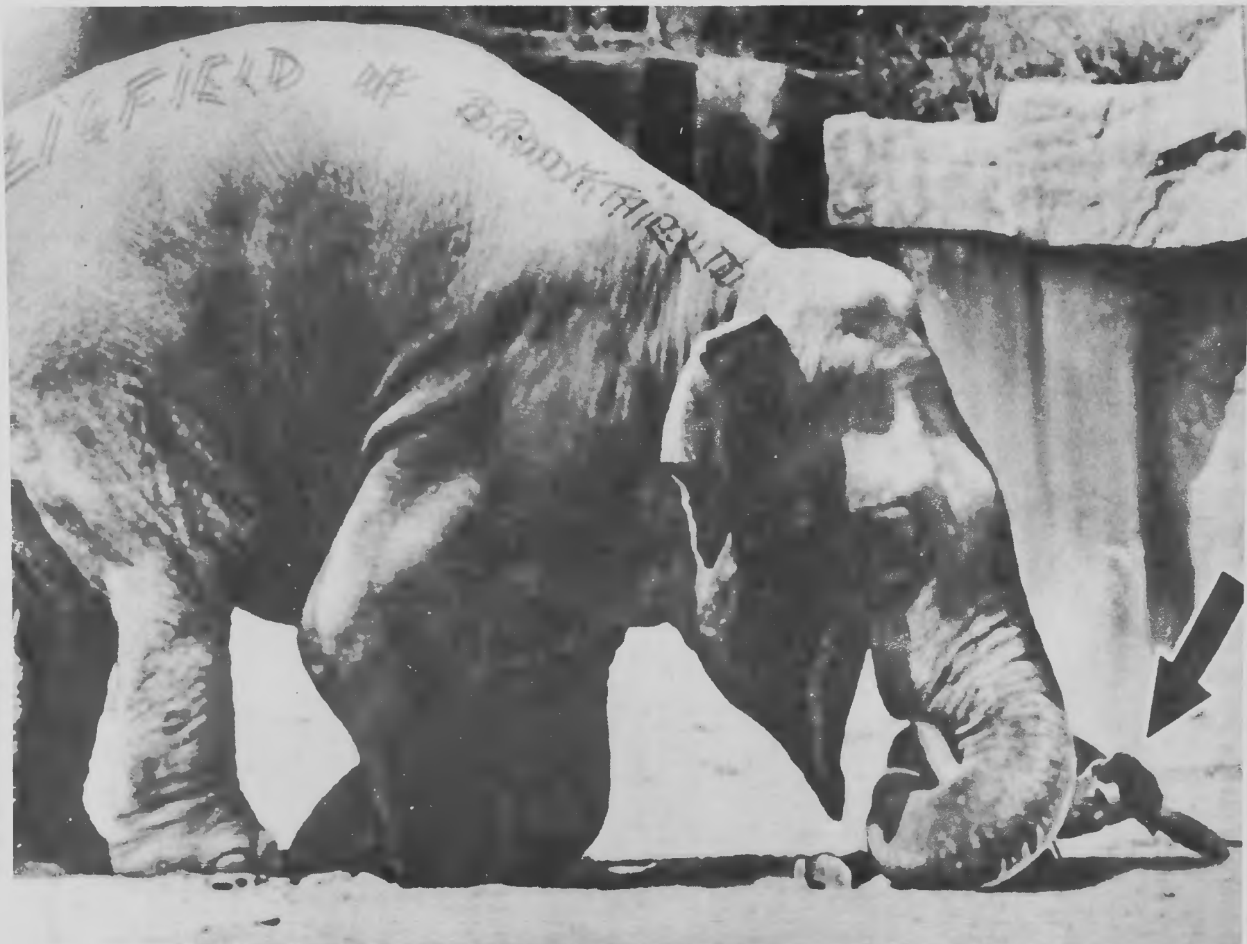
"...Slim pinned between Ziggy's tusks from where he miraculously escaped." (Chicago Daily Tribune, April 27, 1941)