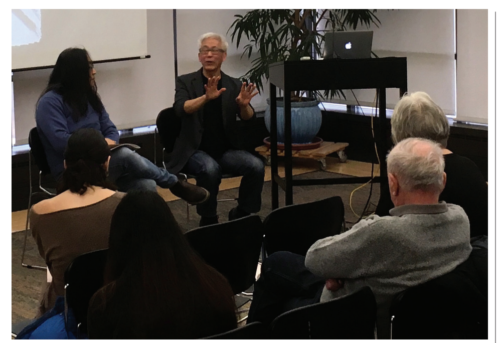
IN CONJUNCTION WITH AN EXHIBITION OF HIS WORK, THE ARTIST ZHANG HONGTU RECENTLY GAVE A TALK IN THE CHARLES CHU ASIAN ART READING ROOM.