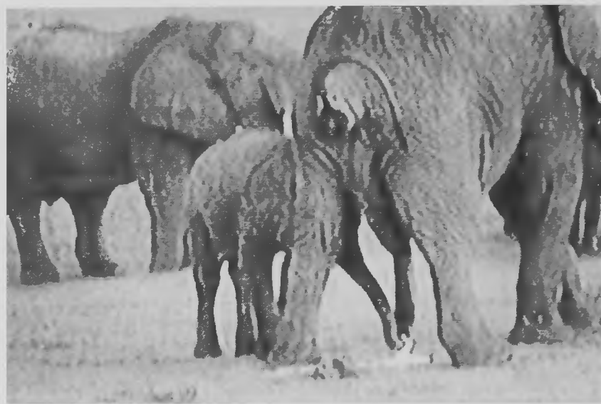
Figure 2. A juvenile elephant takes urine directly from the penis of a large male. It then placed its trunk in its mouth and appeared to swallow the urine (from a video-frame; Nehimba seep, Hwange National Park, Zimbabwe; 7 September 1995).

After drinking, both sexes usually returned to the pan itself for additional mudding (i.e., rolling in the mud and throwing mud on themselves with the trunk) before heading back into the bush to resume foraging. Breeding herds generally drank, mudded, and