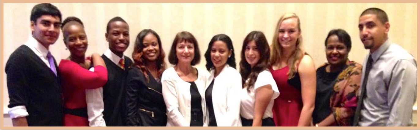
Connecticut College staff and students support the Dr. King Scholarship Fund