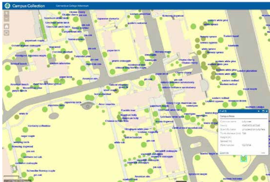
SCREEN SHOT OF THE NEW, INTERACTIVE CAMPUS TREES MAP APPLICATION.