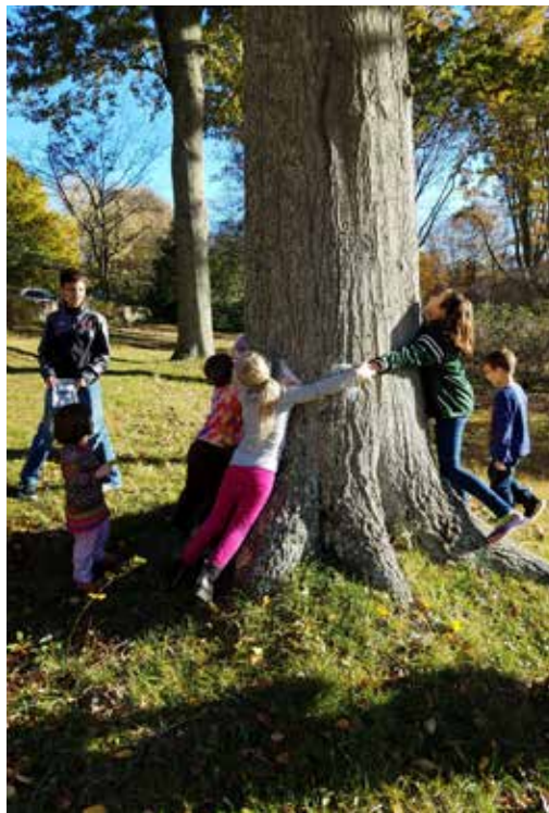
A GROUP OF YOUNG TREE HUGGERS MEASURE A PIN OAK IN THE "IF I WERE AN OAK TREE" PROGRAM, NOV. 2016.

The Arboretum hosted several workshops connecting people to plants. In The Art and Science of Preserving Plant Specimens , participants learned the history of herbarium collections and how to press woody plants, ferns and seaweeds. Painting the Landscape