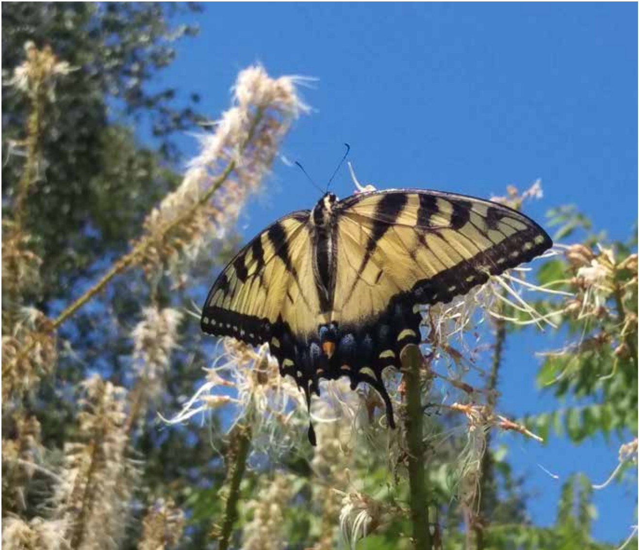
EASTERN TIGER SWALLOWTAIL ON AESCULUS PARVIFLORA