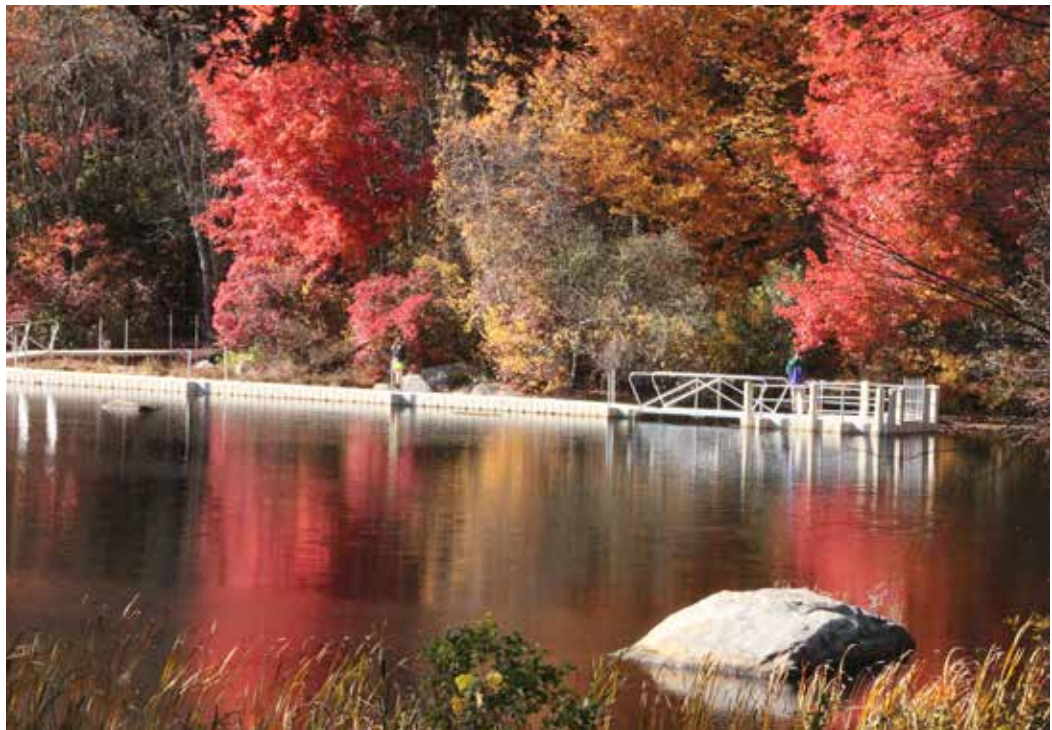
A NEW FLOATING BOARDWALK ON THE WEST SIDE OF THE ARBORETUM POND WAS INSTALLED JUST IN TIME FOR BIOLOGY AND BOTANY LABS IN FALL 2016.

Support for over sixty percent of the board-