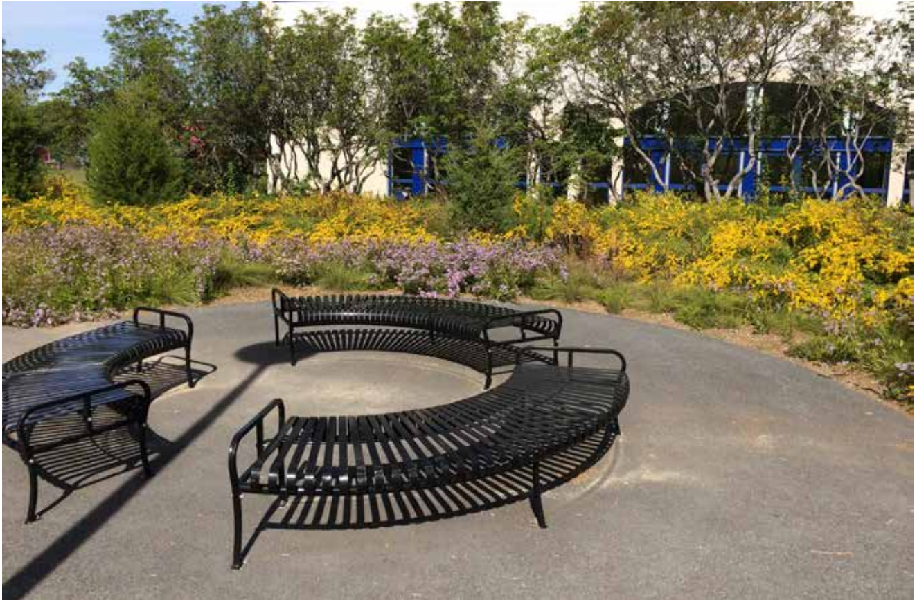
THE NIEDERMAN MEMORIAL NATIVE MEADOW GARDEN JUST SOUTH OF CROSIER- WILLIAMS WAS SPECTACULAR LAST FALL.

since the mid-1980s. This is likely due to the past two summers of severe drought which inhibited the fungus that keeps the gypsy moth population in check. Damage was relatively light and not widespread on College property, and it seems likely that the more normal rainfall pattern this year will allow the fungus to kill most caterpillars before they become egg-laying moths.