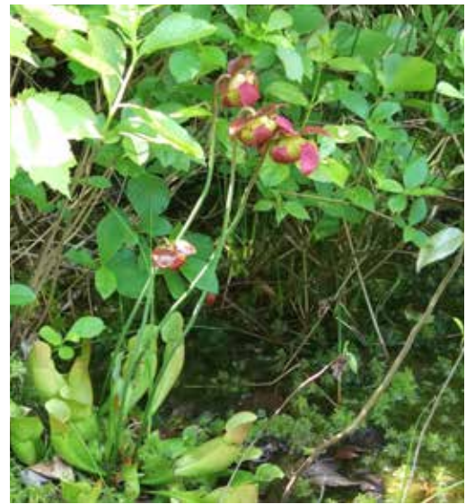
RIGHT: A FLOWERING PITCHER PLANT ( SARRACENIA PURPUREA ) VISIBLE FROM THE NEW BOG BOARDWALK.