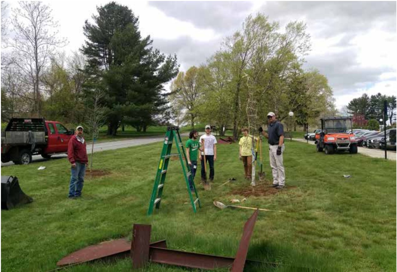
ARBORETUM STAFF AND STUDENT WORKERS PLANTED 5 BLACK TUPELO TREES IN THE GRASSY ISLAND WEST OF THE CAMPUS SOUTH PARKING LOT.

ed between Unity and Becker Houses around which new sidewalks were built. It is hoped that the planning procedures and construction techniques learned during this project will be institutionalized and utilized in the future.