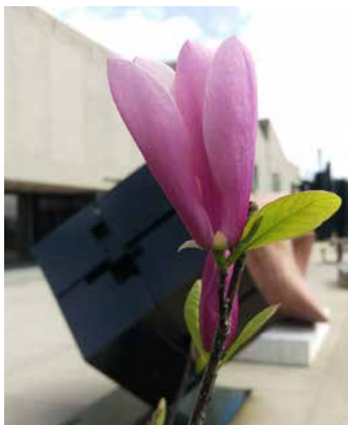
A SPECIMEN OF MAGNOLIA "JANE" WAS PLANTED AS A MEMORIAL TO THE LATE ANIQUE ASHRAF '17.

In February 2017, as part of annual contract pruning and removals, arborists removed 10 mature ash trees from the Native Plant Collection, many located in the Wildflower Garden.