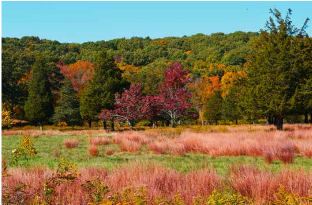
BACK FROM MAMACOKE (AFTER A FIRST YEAR SEMINAR CLASS VISIT) BY A.T. THOMAS '20

seminar to speak about ecological landscaping, habitat conservation and the importance of native plants for pollinators.