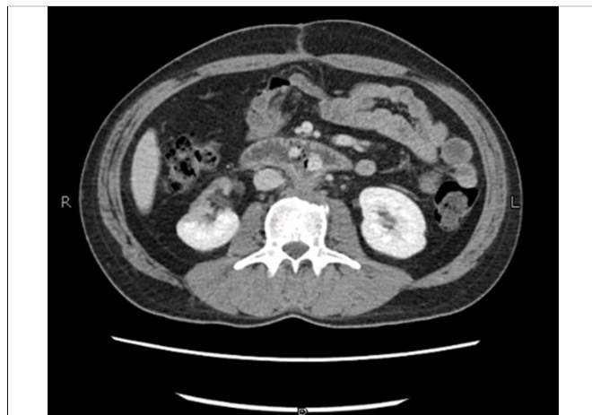
Figure 1: Both limbs of Dacron graft are passing through the duodenum.

As he was young and nutritionally well preserved, the decision for in situ reconstruction was made. This was to be performed after excision of infected graft and bowel repair. Although, he had deep venous thrombosis of left lower leg but recent venous duplex scan showed patent femoral and popliteal veins. After ensuring