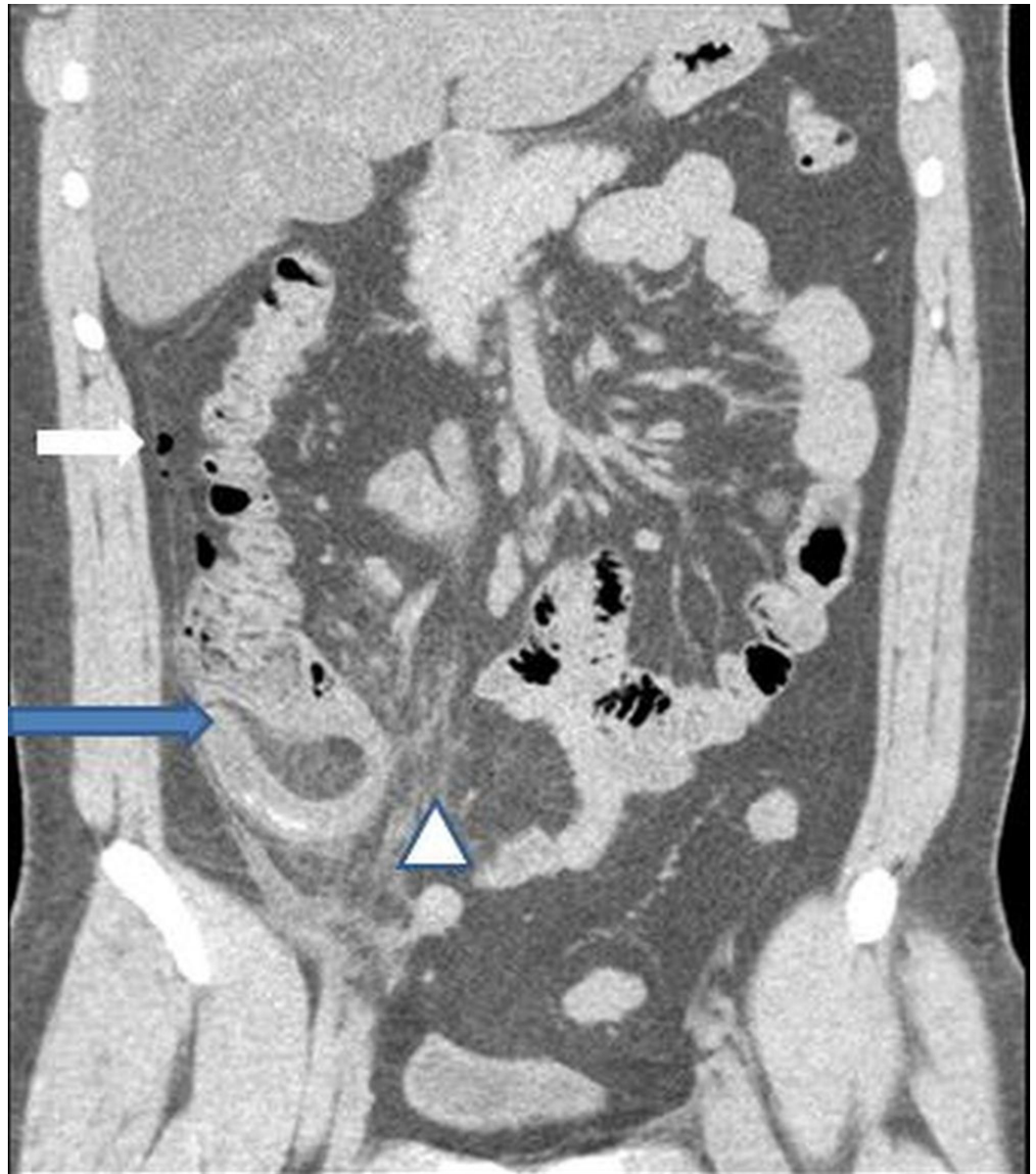
FIGURE 2: Coronal image of abdomen showing swollen appendix (blue arrow) with marked periappendiceal inflammatory fat stranding (arrowhead). Small amount of free air also seen (white arrow)

Specific signs for perforated appendicitis on CT scan included a defect in enhancing the appendiceal wall, focal area of nonenhancement with enhancing of the remaining appendiceal wall, extraluminal air, and extraluminal appendicolith or abscess formation (Figures 2-3).