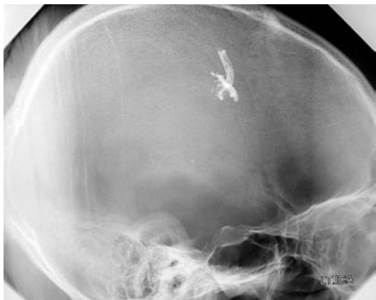
Figure 3. Histoacryl glue seen in AVM with reflux in draining vein.