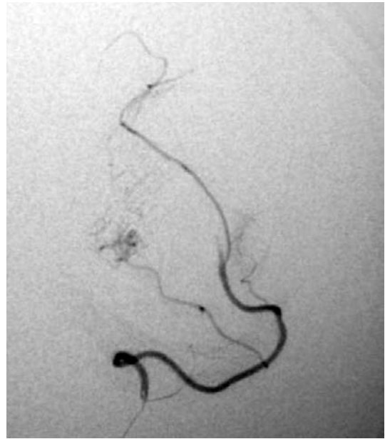
Figure 4. Post-embolization: tiny arterial feeder is still supplying the nidus