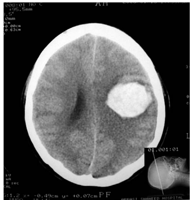
Figure 1. Left parietal hemorrhage.

During embolization, the initial angiographic run revealed an approximately 1.2 cm-sized AVM nidus supplied by two