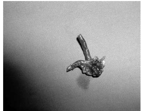
Figure 5. Surgically excised AVM specimen.

branches of the left middle cerebral artery (MCA) that was draining into a superficial cortical vein (Figure 2). With the help of a flow-guided microcatheter, the nidus was occluded via the major feeder with Histoacryl glue. Reflux of glue was noted into the draining vein (Figure 3).