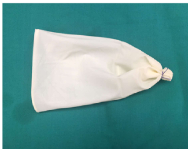
Figure-2: Surgical glove endobag after cutting the finger end of the glove.