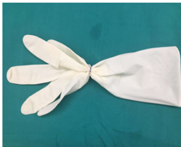
Figure-1: Vicryl suture tied near the wrist to prepare the endobag.

At times, port site incisions can be extended to facilitate