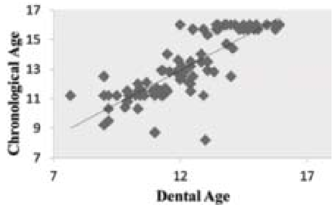
Figure-2: Correlation between dental and chronological age in males n = 135; Spearman Correlation; \rho = 0.843 ; p < 0.001

Statistically significant difference was found in median dental age in the male sample in the three malocclusion groups ( p=0.03 ). Pair-wise comparison of the median dental age in the different malocclusion groups showed statistically significant differences in Class I and II and Class II and III groups only in males (Table 2).