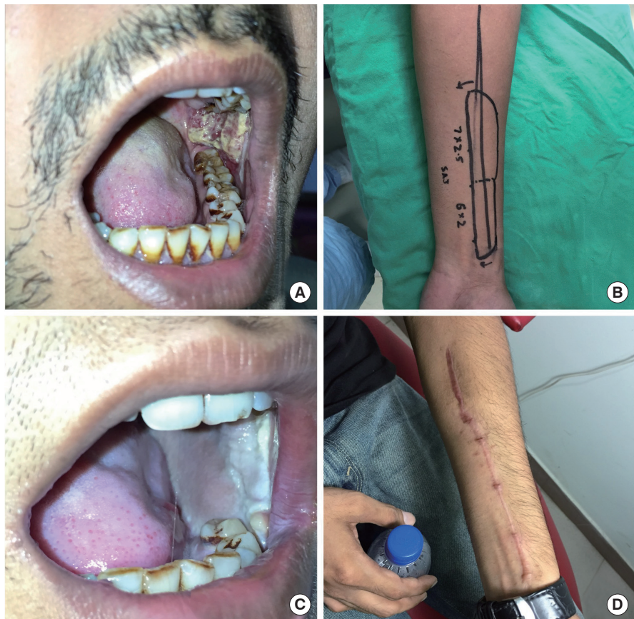
Fig. 3. Tongue carcinoma managed by a nRFFF

(A) Squamous cell carcinoma of the left cheek. (B) Marking of the narrow radial forearm free flap (nRFFF). (C) The nRFFF at 3 months postoperatively. (D) The donor site scar at 3 months postoperatively.