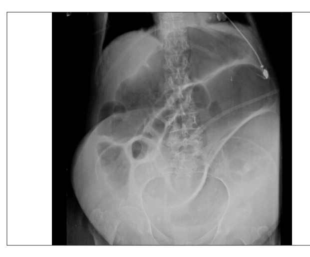
Figure 2: After neostigmine administration.

tube insertion; but condition did not improve. Patient was then started on neostigmine initially at a dose of 0.5 mg every 6 hours, which was later increased to 1 mg. Following 24 hours, patients had passed a significant volume of stool and repeat X-rays showed significant improvement and a decrease in the dilation of intestinal loops as seen in Figure 2. Patient was discharged home and scheduled for hip surgery at a later date.