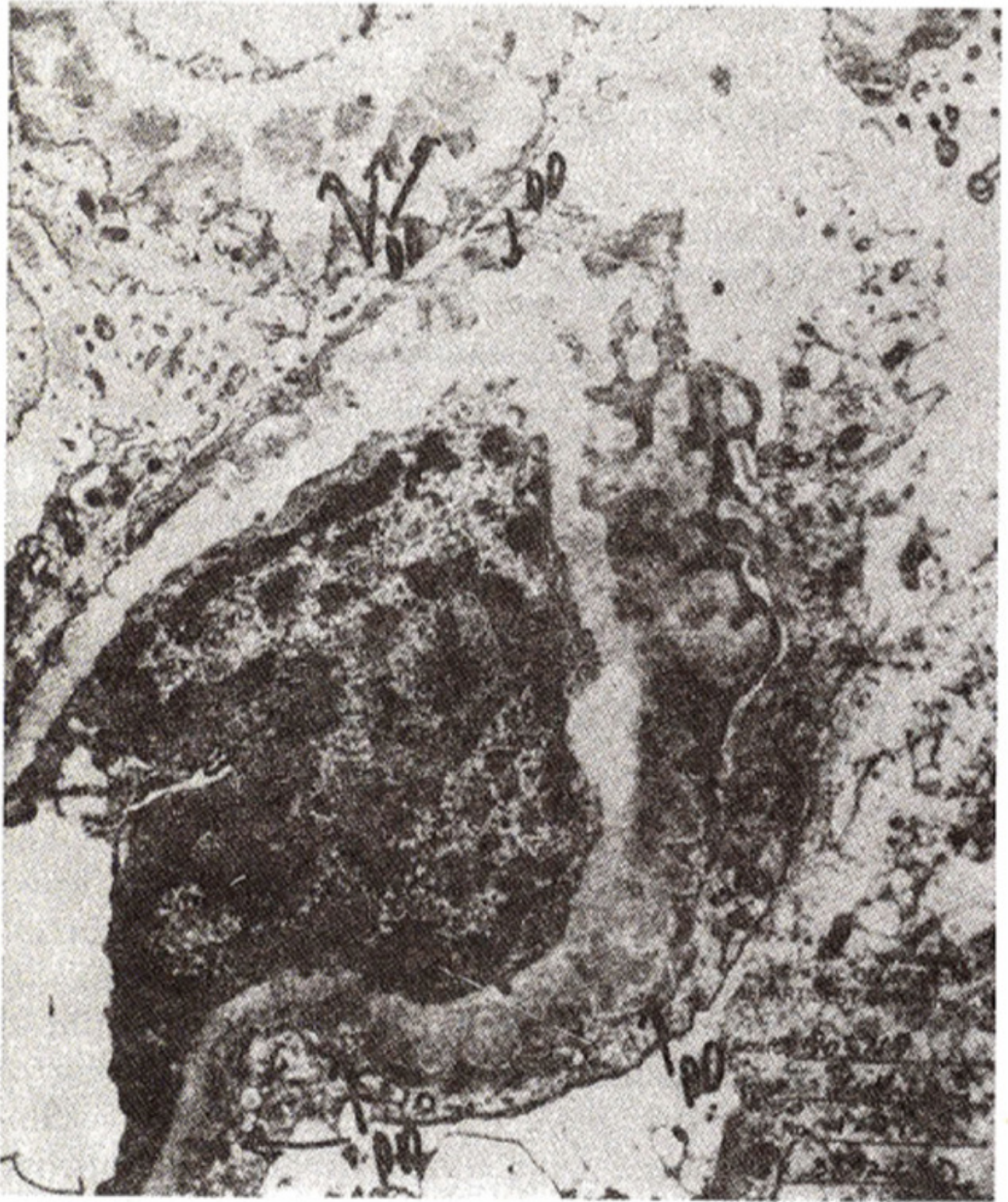
Figure 2. Electron micrograph showing thick glomerular basement membrane with dense deposits (arrows).

revealed irregularly thickened basement membrane with dense deposit distributed along the subepithelial aspects; these were separated and occasionally surrounded by basement membrane extensions. Epithelial foot processes demonstrated effacement and the tubules showed mild degenerative change (Figure 3).